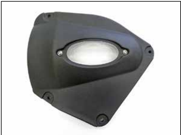
26. Install the AIRAID® window into the AIRAID® air filter housing lid and secure with the provided hardware.