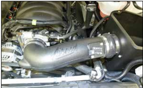
22. Install the AIRAID® intake tube into the coupler at the air filter housing and then into the coupler on the throttle body, adjust the tube for best fit and then secure with the provided hose clamps.