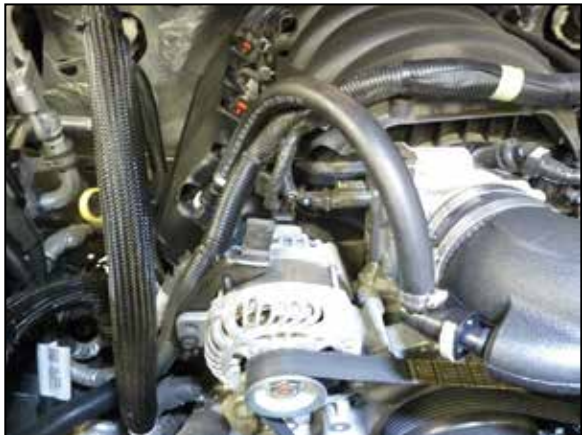
23. Install the crank case vent hose assembly onto the valve cover port and onto the 90° fitting on the intake tube.