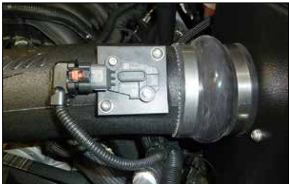
25. Reconnect the mass air sensor electrical connection. Use the provided tie wrap to secure the wiring harness to the A/C line with some slack for the wiring connector.