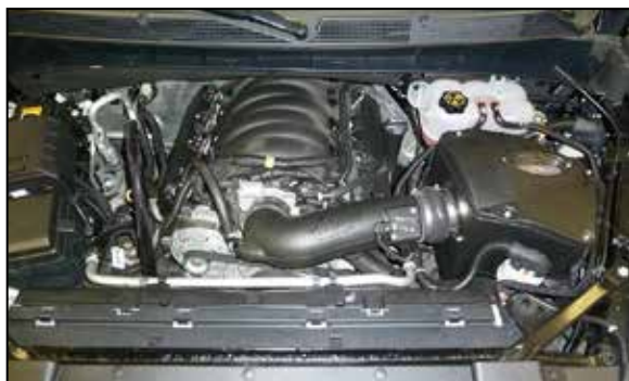
30. Double check your work! Make sure there is no foreign material in the intake path. Make sure all clamps, hoses, bolts, and screws are tight. Double check the hood clearance! Reconnect the negative battery cable!