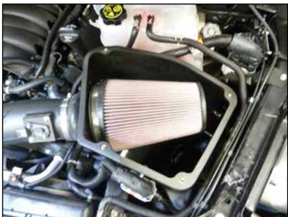
24. Install the AIRAID® air filter onto the filter adapter and secure with the provided hose clamp.