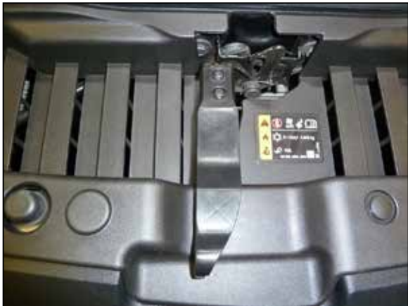
29. Reinstall the hood release arm to the hood latch and secure with the factory bolts.