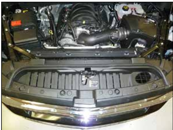
28. Reinstall the upper radiator valence and secure with the factory retaining clips.