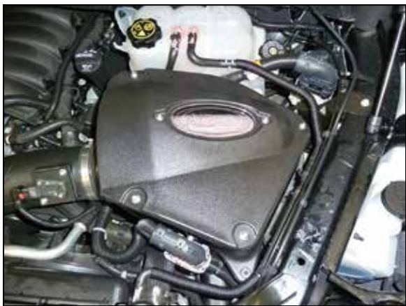
27. Install the AIRAID® air filter housing lid onto the air filter housing and secure with the provided hardware.