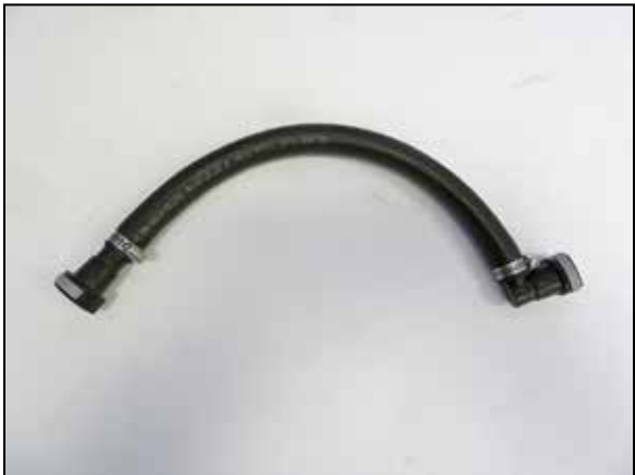
10. Assemble the crank case hose assembly as shown.