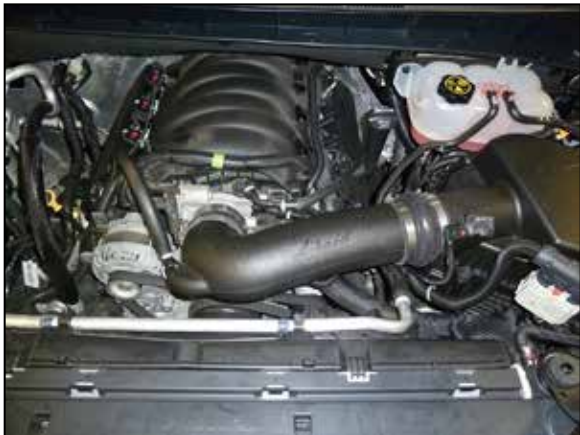
12. Double check your work! Make sure there is no foreign material in the intake path. Make sure all clamps, hoses, bolts, and screws are tight. Double check the hood clearance! Reconnect the negative battery cable!