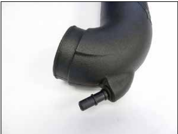
8. Install the provided grommet and quick connect fitting into the AIRAID® intake tube as shown.