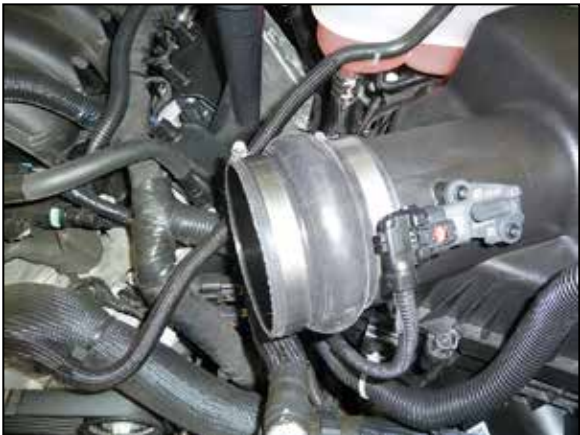
7. Install the provided hump coupler onto the filter housing and secure with the provided hose clamp.