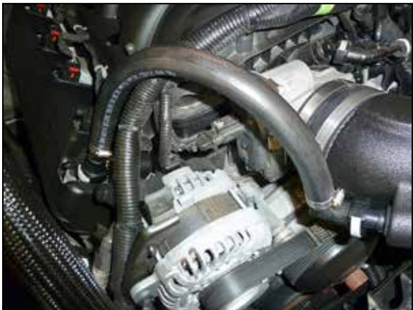
11. Install the crank case hose assembly onto the quick connect fittings on the intake tube and valve cover as shown.