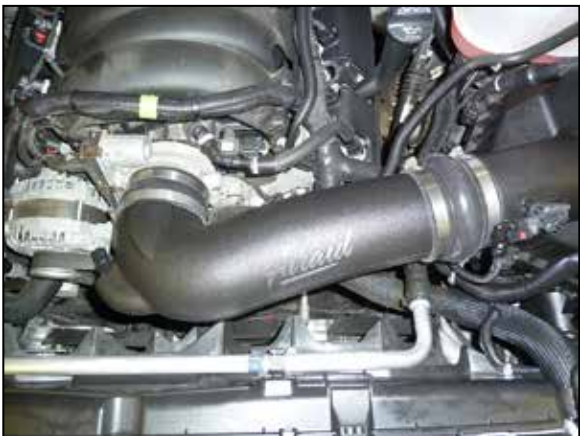
9. Install the AIRAID® intake tube into the hump coupler and then the coupler at the throttle body, adjust the tube for best fit and secure with the provided hose clamps.