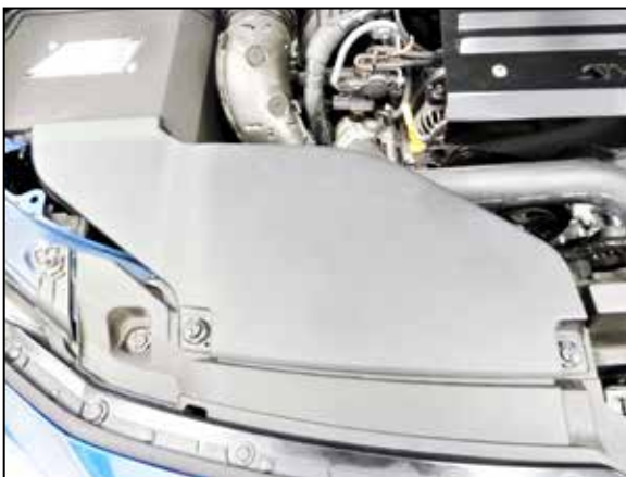
23. Reinstall the fresh air intake duct into the heat shield and secure with the factory mounting pins.