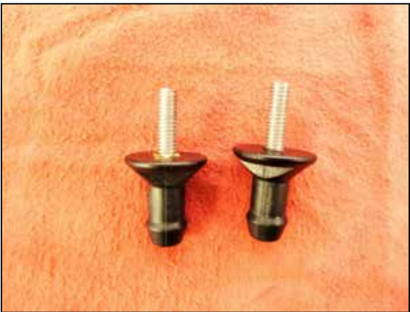
19. Install the provided studs into the mounting posts.