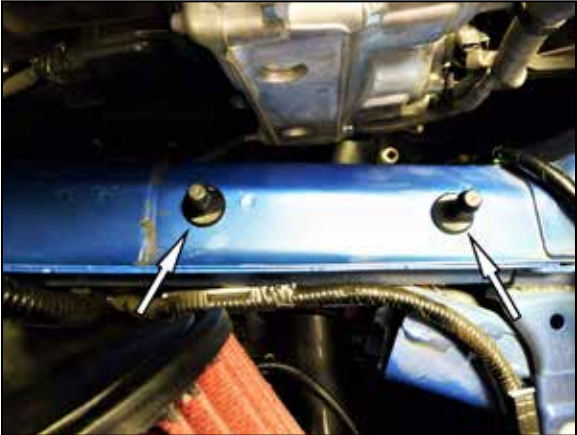
20. Install the mounting posts into the frame rail where shown.