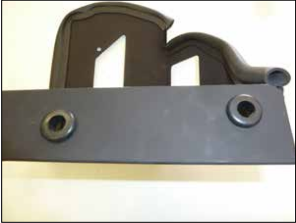
17. Install the mounting grommets into the holes in the bottom of the heat shield.