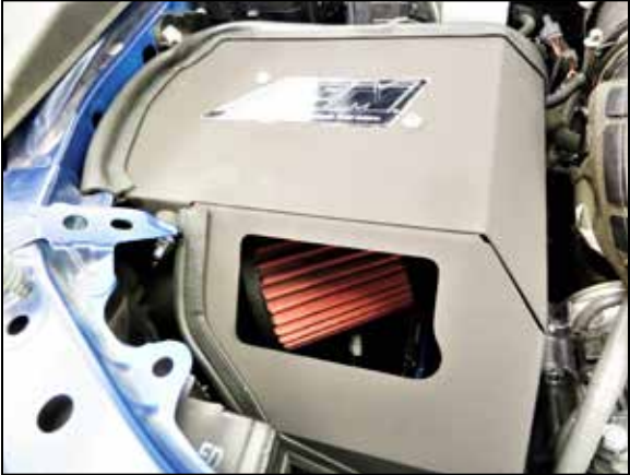
22. Install heat shield assembly onto the mounting studs and vibration mounts, secure with the factory mounting nuts.