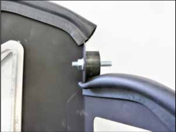
21. Install the provided vibration damper onto the heat shield using the factory nut.