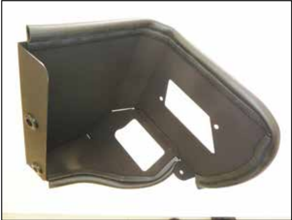
16. Install the provided edge trim onto the heat shield as shown. Some trimming of the edge trim will be necessary.