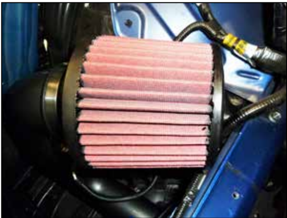
15. Install the AEM air filter onto the intake tube and secure with the provided hose clamp.