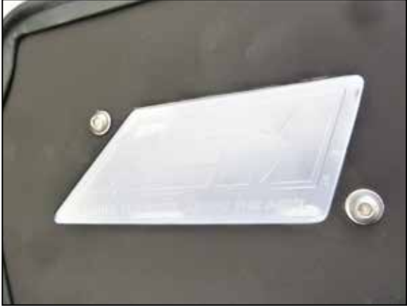
18. Install the AEM window into the heat shield using the provided hardware.