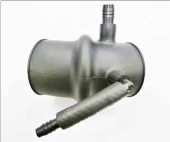
12. Assemble the AEM intake hose assembly and vents as shown.