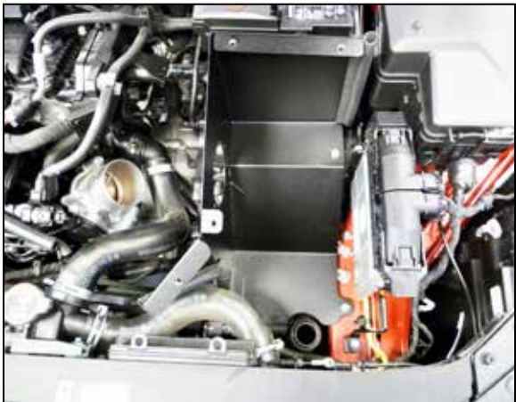
11. Install the heat shield assembly onto the rubber mounted studs and secure with the provided hardware.