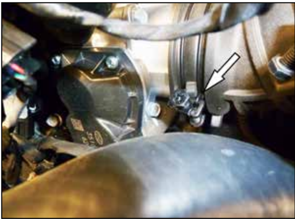
4. Loosen the hose clamp that secures the factory intake tube to the throttle body.