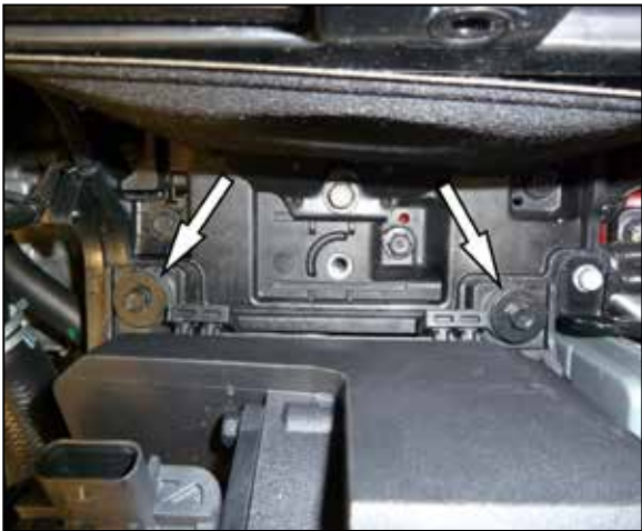
7. Remove the two rear air filter housing mounting bolts and then remove the complete intake assembly.