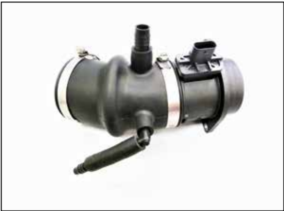
13. Install the factory mass air sensor into the AEM hose as shown but don't tighten the clamp.