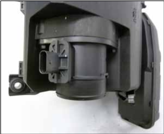
8. Remove the two bolts that secure the mass air sensor to the upper air filter housing and then remove the sensor from the housing.