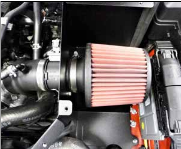
16. Install the AEM air filter onto the mass air sensor and secure with the provided hose clamp.