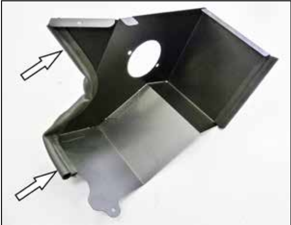
10. Cut a 7" long section of the edge trim and then install the edge trim onto the heat shield as shown trimming off access.