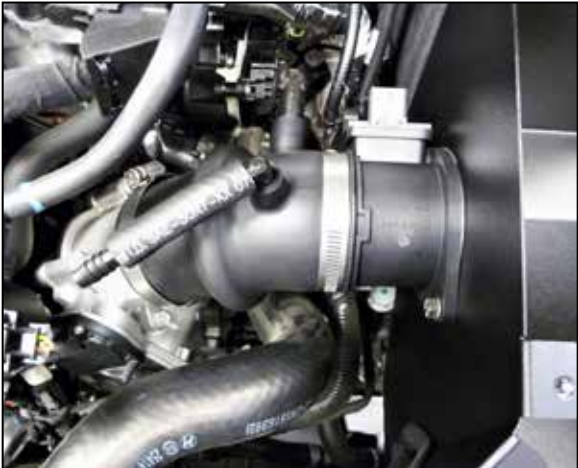
14. Install the hose/maf housing assembly onto the throttle body and into the heat shield. Adjust the maf housing so the holes line up and secure with the provided hardware. Adjust the hose for best fit and then secure with the provided hose clamps.