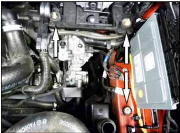
9. Install the three rubber mounted studs in the places shown.