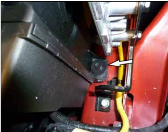
6. Remove the lower air filter housing retaining bolt.