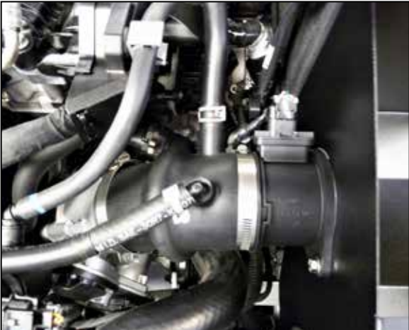
15. Reconnect the vent lines and secure with the factory spring clamps. Reconnect the mass air sensor electrical connection.