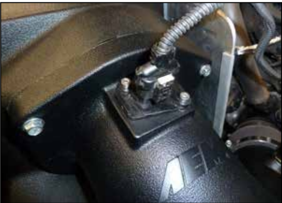
16. Reconnect the sensor electrical connection.