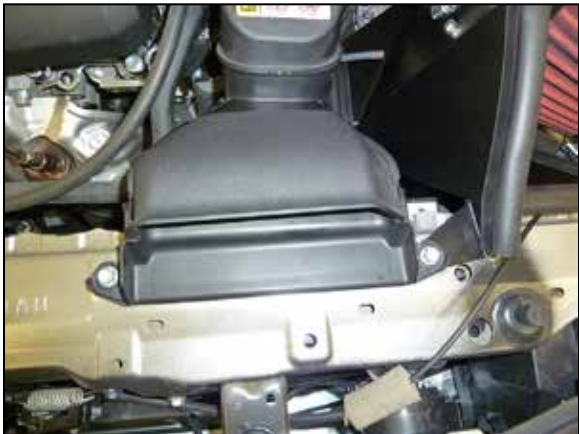
13. Install the fresh air intake duct and secure with the factory hardware.