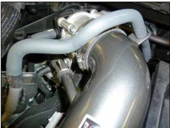
17. Connect the factory crank case vent line to the vent tube on the AEM® intake tube and secure the brake booster vacuum line to the intake tube as shown.