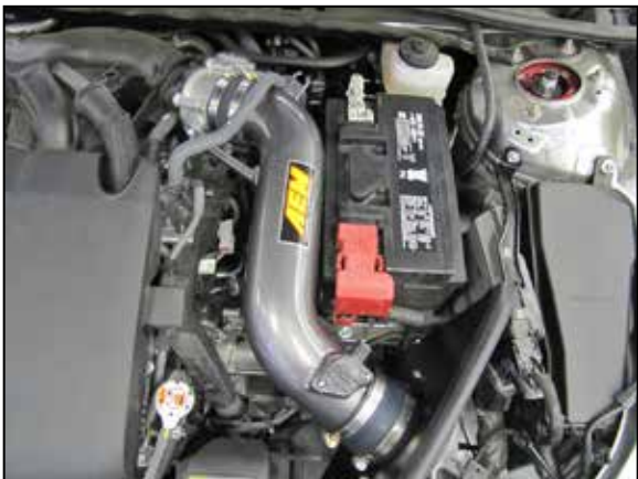
16. Install the AEM® intake tube into the Coupling hoses, adjust the tube for best fit and then secure with the provided hose clamps.