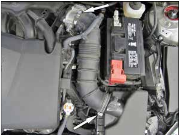
5. Loosen the hose clamps that secure the intake tube to the throttle body and air filter housing, unhook the vent lines attached to the intake tube and then remove the tube from the vehicle.