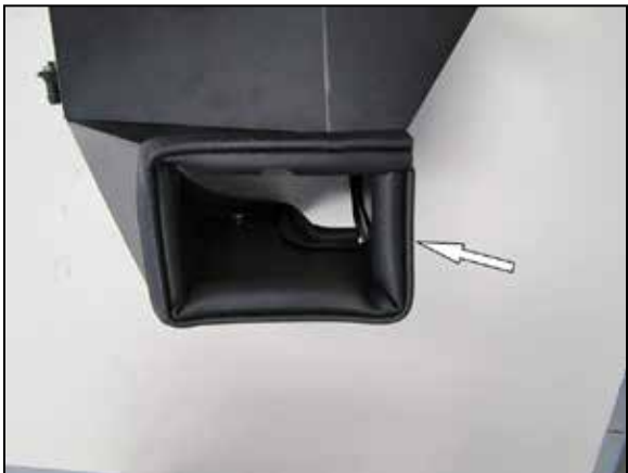
9. Install the side bulb edge trim onto the heat shield as shown.