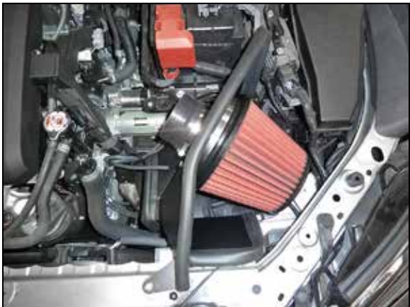
11. Install the heat shield assembly into the vehicle so the mounting studs engage the factory mounting grommets.