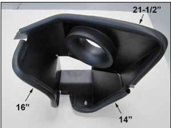
8. Cut the provided top bulb edge trim into sections of 21-1/2", 16" and 14" and then install them onto the heat shield as shown.