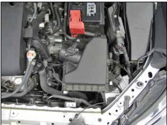
6. Lift up the air filter housing to dislodge it from the mounting grommets and then remove the housing from the vehicle.