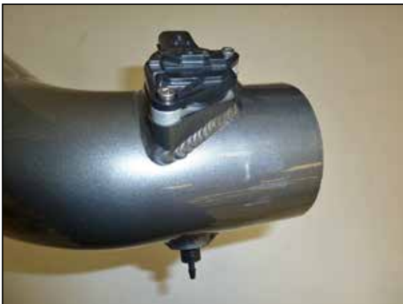
15. Remove the mass air sensor from the factory air filter housing and install it into the AEM® intake tube using the provided hardware. Install the provided vacuum fitting into the AEM® intake tube. NOTE: Plastic NPT fittings are easy to cross thread. Install the vent fitting "hand" tight, then turn it two complete turns with a wrench.