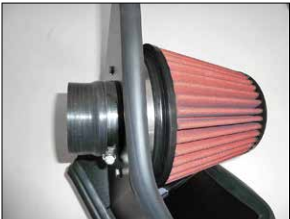
10. Install the provided air filter and coupling hose (5-352) onto the filter adapter and secure with the provided hose clamps.