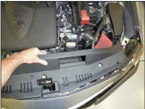
14. Reinstall the radiator cover and secure with the factory push clips.