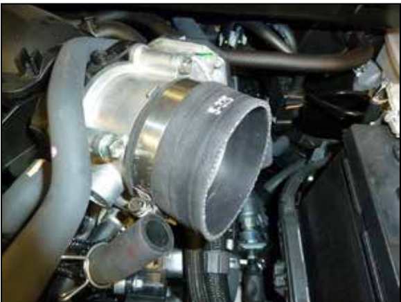
12. Install the provided coupler hose (5-326) onto the throttle body and secure with the provided hose clamp.