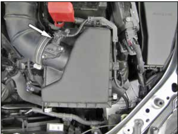
4. Disconnect the mass air sensor electrical connection and unclip the wiring harness from the air filter housing.