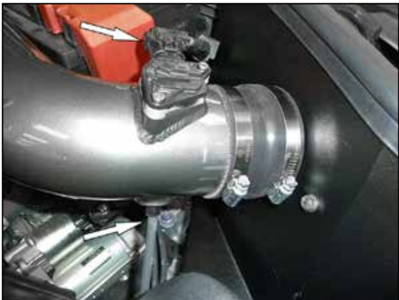
18. Connect the vacuum line to the AEM® intake tube and reconnect the mass air sensor electrical connection.