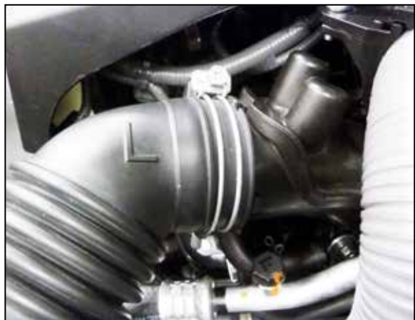
4. Loosen the hose clamps that secure the factory upper intake tubes and then remove the upper housings and intake tubes. NOTE: K&N Engineering, Inc., recommends that customers do not discard factory air intake.