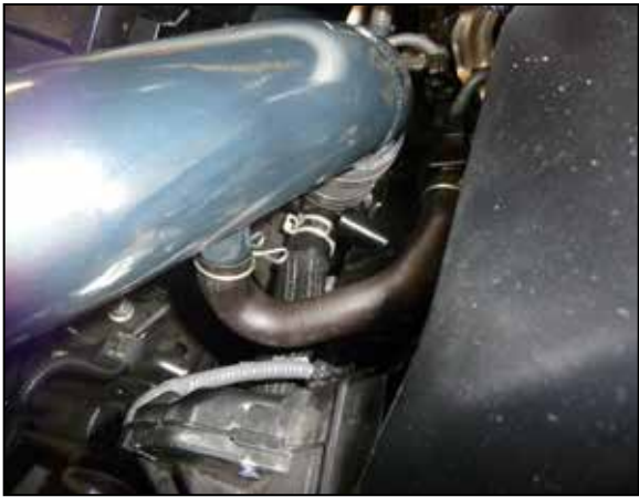
22. Connect the passenger side PCV hose to the fitting installed into the intake tube and secure with the factory spring clamp.