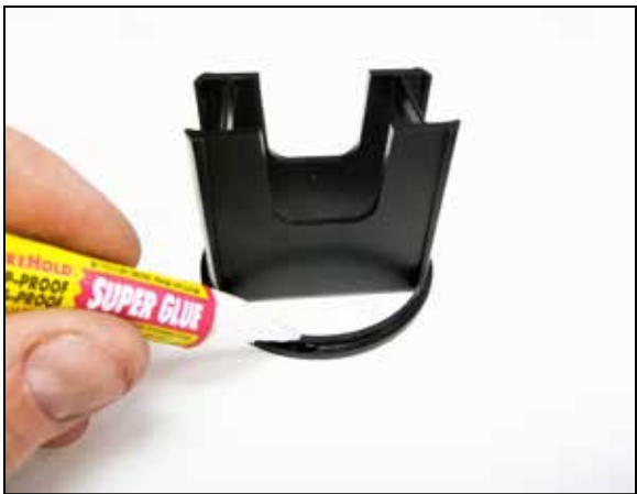
17. Apply four drops of the provided super glue to the air straighteners as shown.