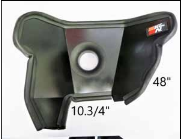
11. Cut the 61”L edge trim to lengths of 10.75” and 48”, install the edge trim onto the driver side heat shield as shown.