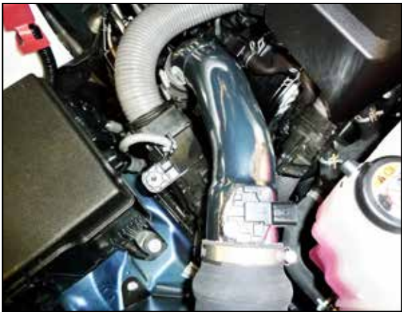
20. Install the passenger side intake tube into the couplers, adjust the tube for best fit and then secure with the provided hose clamps.