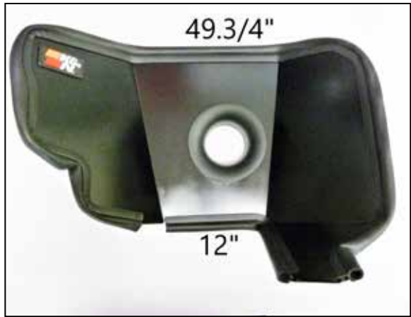
12. Cut the 66"L edge trim to lengths of 12" and 49.75", install the edge trim onto the driver side heat shield as shown.