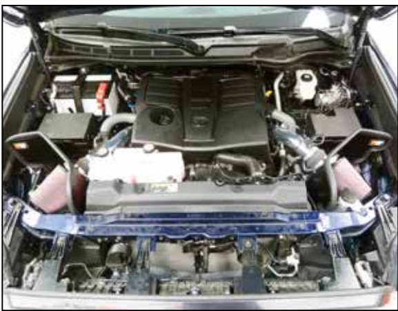
25. Reconnect the vehicle's negative battery cable. Double check to make sure everything is tight and properly positioned before starting the vehicle.