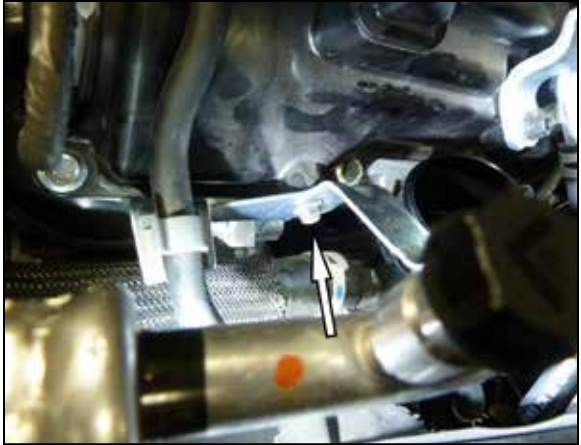
7. Remove the bolt that secures the driver side intake tube mounting bracket and then remove the bracket from the vehicle.