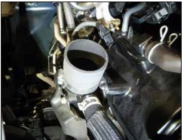
9. Install the provided couplers onto the turbo inlets and secure with the provided hose clamps.