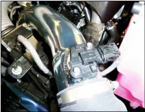
23. Reconnect the mass air sensor electrical connections.