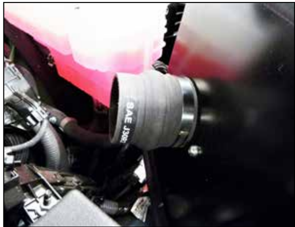
15. Install the provided hump couplers onto the filter adapters and secure with the provided hose clamp.