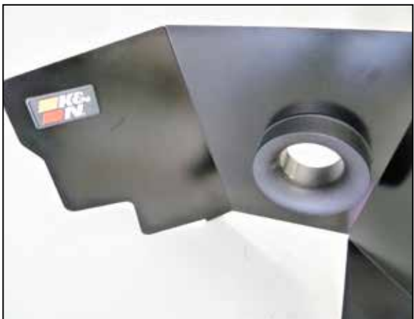
10. Install the filter adapters and K&N badges onto the heat shields using the provided hardware.