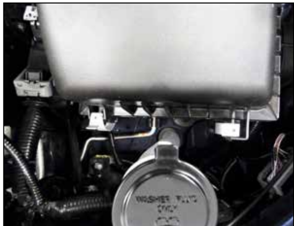
3. Release the retaining clips that secure the upper air filter housings.