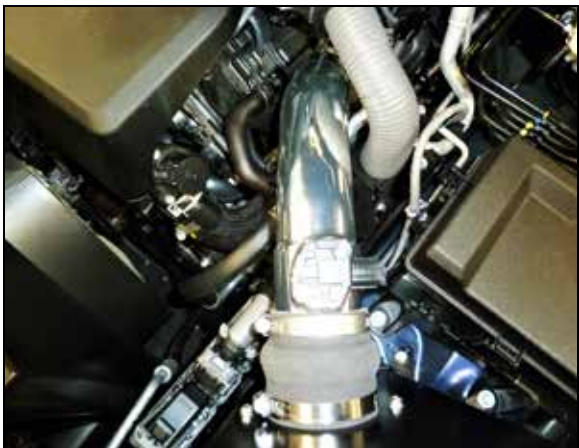
19. Install the driver side intake tube into the couplers, adjust the tube for best fit and then secure with the provided hose clamps.