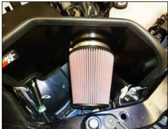
24. Install the K&N air filters onto the filter adapters and secure with the provided hose clamp.