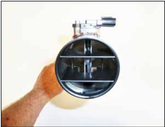
18. Install the air straighteners into the K&N intake tubes so that the blades are aligned as shown in relation to the mass air sensor.