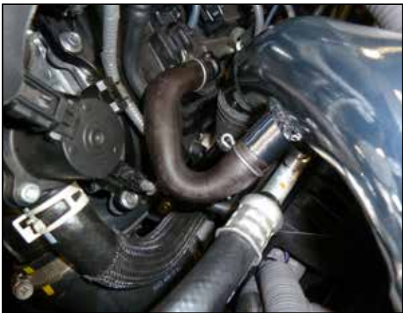
21. Connect the driver side PCV hose to the fitting installed into the intake tube and secure with the factory spring clamp.