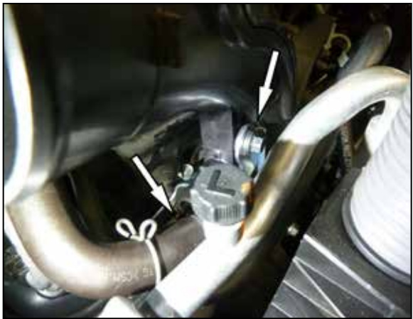
6. Disconnect the PCV hose from the driver side lower intake tube, Remove the intake tube mounting bolt then loosen the hose clamp securing the intake tube to the turbo inlet and remove the tube from the vehicle.