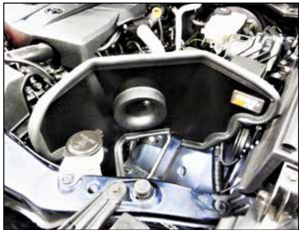
13. Install the driver side heat shield assembly and secure with the provided hardware.