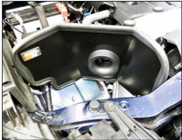
14. Install the passenger side heat shield assembly and secure with the provided hardware.