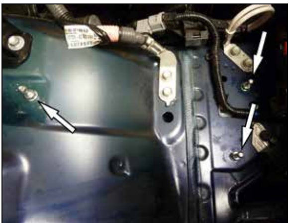
8. Remove the three air filter housing mounting studs from both the left and right sides.