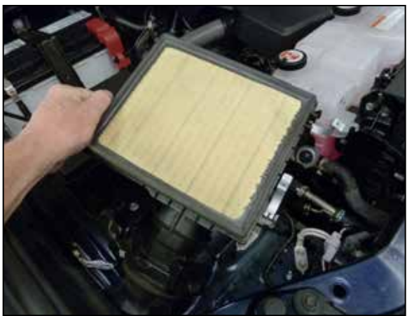
5. Disconnect the PCV hose from the passenger side lower intake tube, Remove the intake tube mounting bolt then loosen the hose clamp securing the intake tube to the turbo inlet and remove the tube from the vehicle.