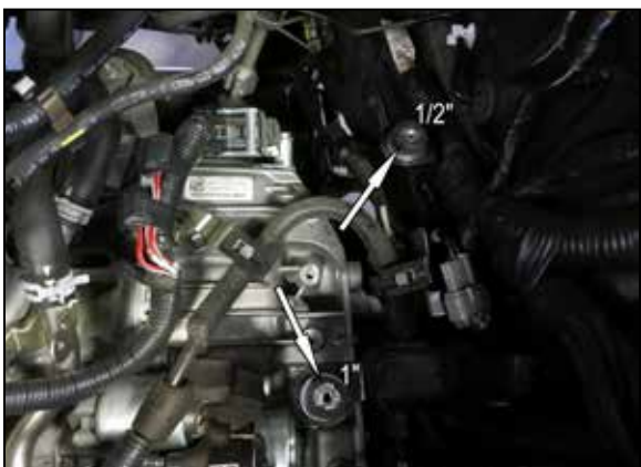
11. Install the 1/2" rubber mounted stud onto the front housing mount and the 1" mounting stud onto the rear housing mount.