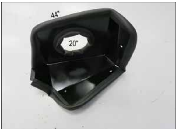
15. Install the provided edge trim into the hole and around the outside edge of the heat shield as shown. Some trimming of the edge trim will be necessary.