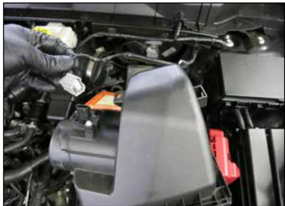
6. Position the upper housing and access the mass air sensor electrical connection. Disconnect the mass air sensor electrical connection and the remove the housing from the vehicle.