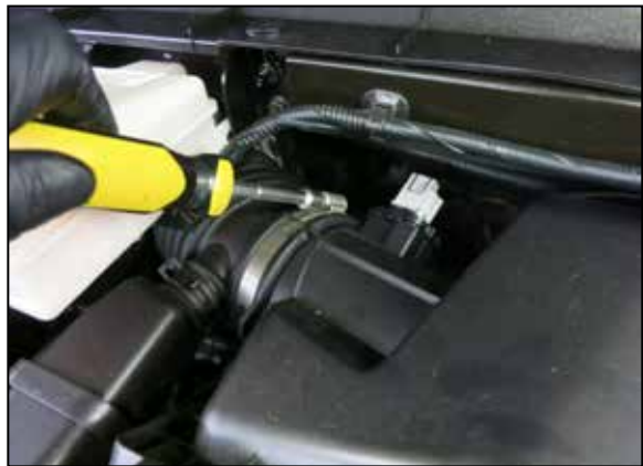
5. Loosen the hose clamp that secures the intake tube to the upper filter housing and disconnect the hose from the housing.