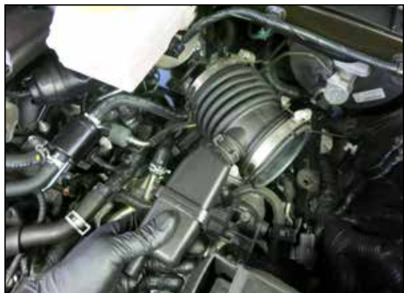
8. Loosen the clamp that secures the factory intake tube to the throttle body and then remove the intake tube from the vehicle.