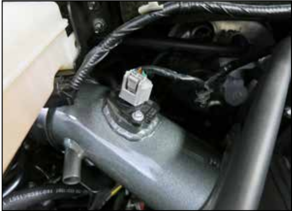
24. Reconnect the mass air sensor electrical connection.