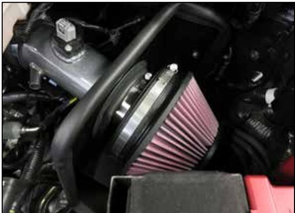
26. Install the K&N filter onto the filter adapter and secure with the provided hose clamp.