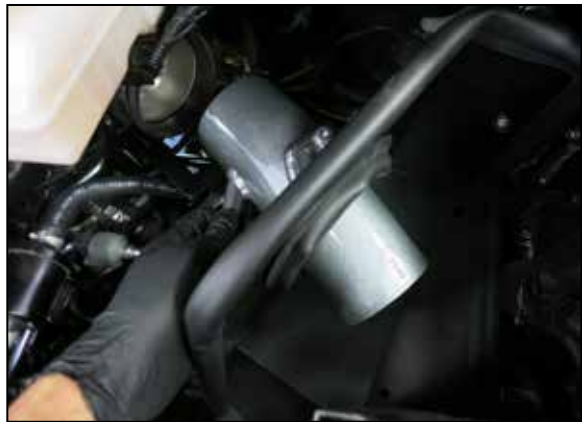
21. Pass the K&N tube through the hole in the heat shield.