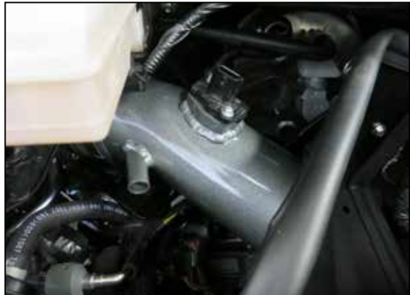
22. Remove the mass air sensor from the factory air filter housing and install it into the K&N intake tube using the provided screws.