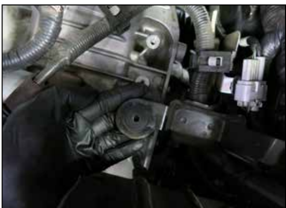
10. The 1/2" and 1" rubber mounted studs will be assembled in the order shown onto the air filter housing mounting points.