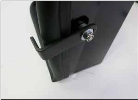
16. Install the heat shield mounting bracket onto the heatshield using the provided spacer and hardware.