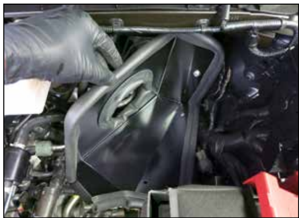
18. Set the heatshield into position on the mounting studs.