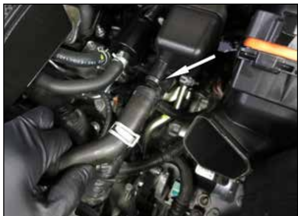
4. Release the spring clamp that secures the CCV hose to the air filter housing and then disconnect the hose from the housing.