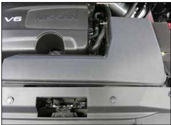
28. Reinstall the factory fresh air intake duct and secure with the factory hardware.