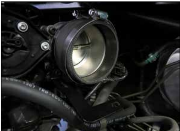
14. Install the provided coupler onto the throttle body and secure with the provided hose clamp.