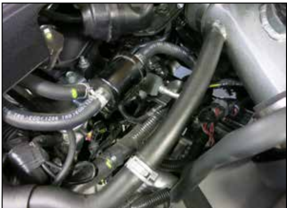
27. Install the provided hose mender into the factory CCV hose and secure with the factory clamp. Then install the provided CCV hose to hose mender and connect to the K&N intake tube.