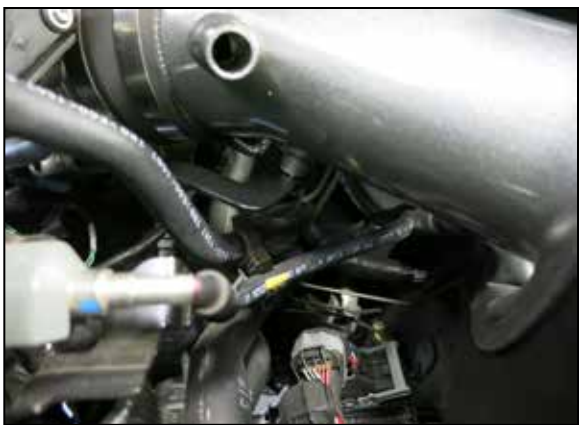
23. Install the tube into the coupler and then align with the mounting bracket previously installed. Secure the tube to the bracket with the provided hardware and hose clamp.