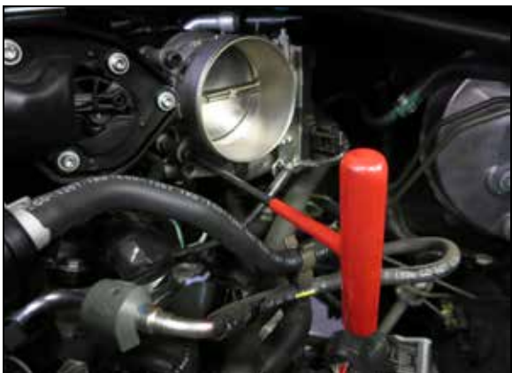
12. Remove the front lower throttle body mounting bolt.