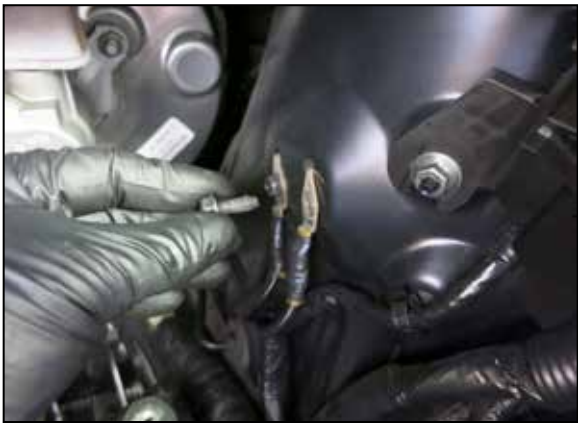
17. Remove the bolt that secures the ground to the strut tower, do not remove the ground.