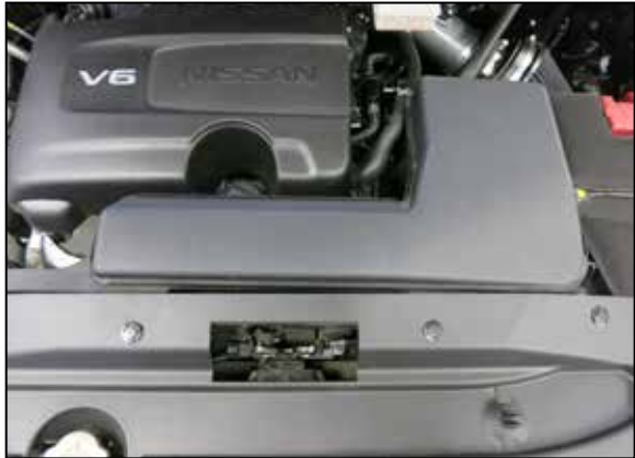
29. Reconnect the vehicle's negative battery cable. Double check to make sure everything is tight and properly positioned before starting the vehicle.

30. It will be necessary for all K&N® high flow intake systems to be checked periodically for realignment, clearance and tightening of all connections. Failure to follow the above instructions or proper maintenance may void warranty.