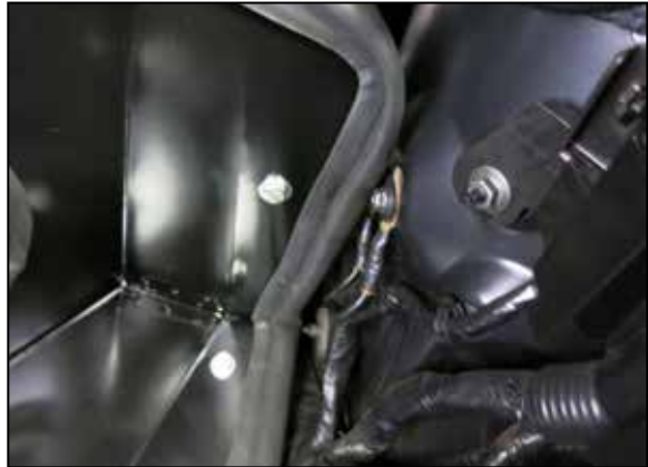
19. Align the mounting bracket with the ground location and then secure the bracket with the factory bolt removed from the ground. Be sure the ground is between the bracket and the strut tower, the ground should be in its original location.