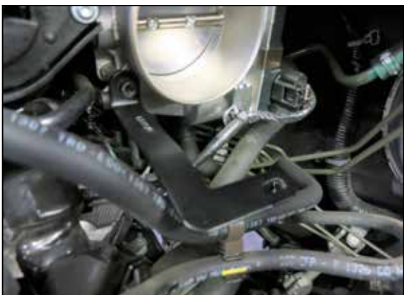
13. Install the K&N intake tube mounting bracket onto the throttle body and secure with the factory bolt removed in the previous step.