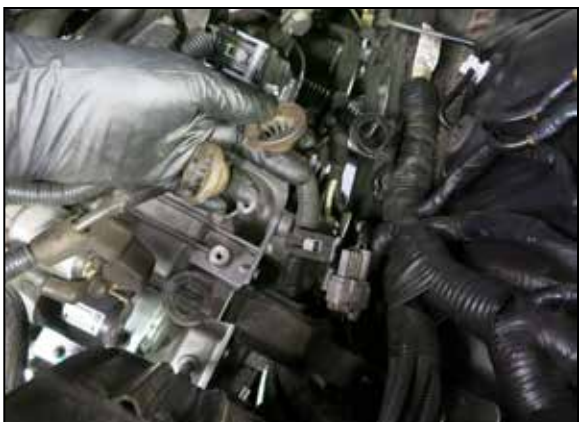
9. Remove the two-factory air filter housing mounting grommets.