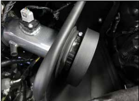
25. Install the radius filter adapter onto the intake tube with the provided coupler and hose clamps.