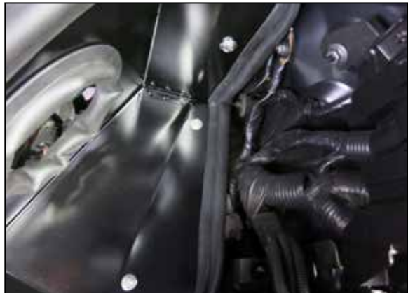
20. Secure the heatshield to the mounting studs with the provided hardware.