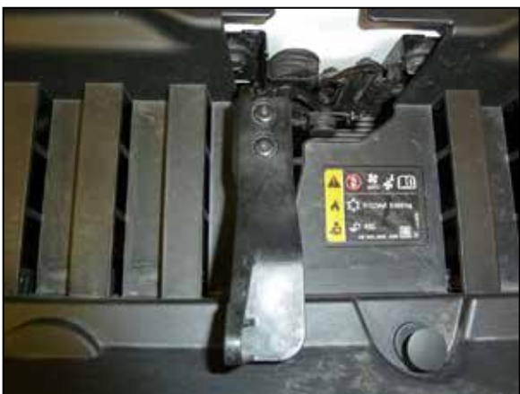
17. Reinstall the hood release arm and secure with the factory hardware.