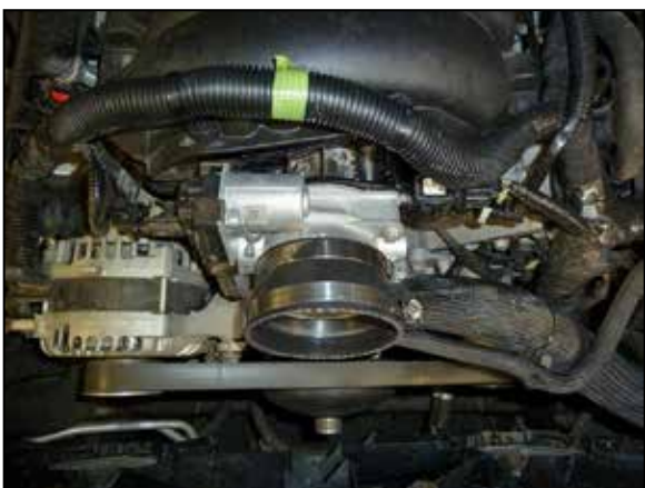
19. Install the provided reducer coupler onto the throttle body and secure with the provided hose clamp. NOTE: On 5.3L equipped vehicles use coupler #KITRDCR23, on 6.2L vehicles use coupler #KITRDCR19.