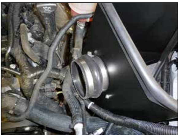
18. Install the provided hump coupler onto the filter adapter and secure with the provided hose clamp.