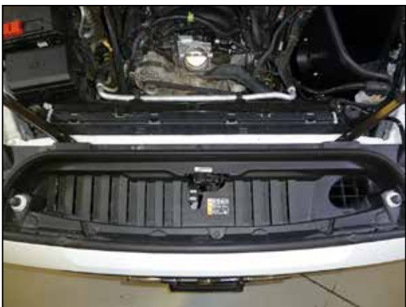
16. Reinstall the radiator valence and secure with the ten factory clips.