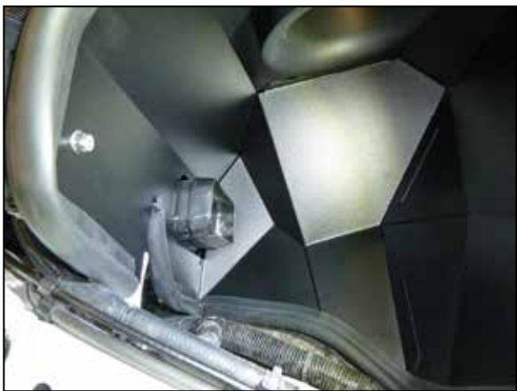
14. Install the heat shield assembly into the vehicle so the mounting grommet slides into the factory mounting hole. Slide the fresh air intake scoop into the opening in the heat shield and resecure to the core support with the factory clip. Secure the heat shield with the factory nut removed in step #9.