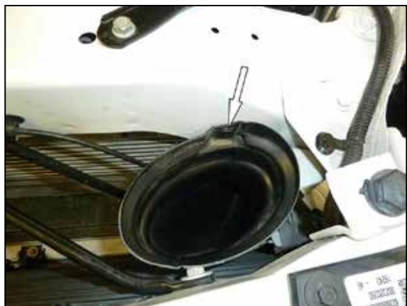
7. Remove the plastic retaining clip that secures the fresh air intake duct to the core support, then pull the duct forward to disengage it from the factory air filter housing.