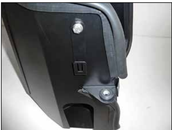
12. Install the provided wiring connector mounting bracket onto the heat shield using the provided hardware. Install the factory mounting grommet into the heat shield as shown.