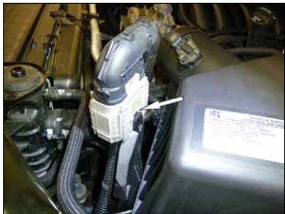
8. Using a small 90° pick or similar tool, release the locking tab that secures the wiring harness bulk connector to the air filter housing and then unhook the connector from the housing.