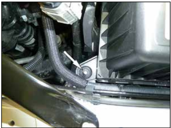
9. Remove the nut that secures the air filter housing. Unhook the wiring harness from the filter housing and then remove the air filter housing from the vehicle.

NOTE: Go slow and use caution to remove the housing. It is indexed into two holes in the rear with rubber grommets that can fall off easily and be lost. It is a tight fit but will come out without being forced. These grommets and nut will be reused in later steps. NOTE: K&N Engineering, Inc., recommends that customers do not discard factory air intake.