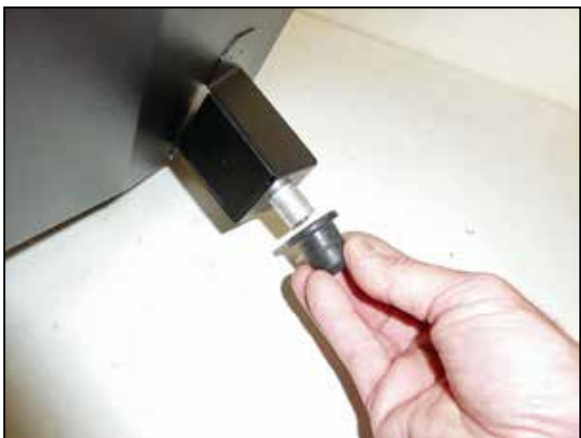
13. Install the provided grommet mount onto the heat shield using the provided hardware and then install the factory mounting grommet onto the mount as shown.