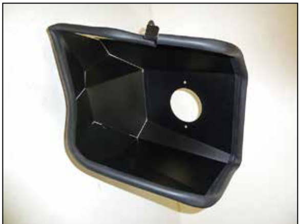
10. Install the provided edge trim onto the heat shield as shown. NOTE: Some trimming of the edge trim will be necessary.

NOTE: Go slow and use caution to remove the housing. It is indexed into two holes in the rear with rubber grommets that can fall off easily and be lost. It is a tight fit but will come out without being forced. These grommets and nut will be reused in later steps. NOTE: K&N Engineering, Inc., recommends that customers do not discard factory air intake.