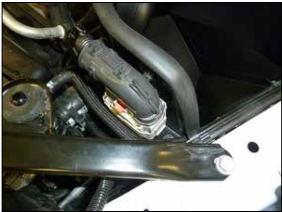
15. Connect the wiring bulk connector onto the bracket installed onto the heat shield.