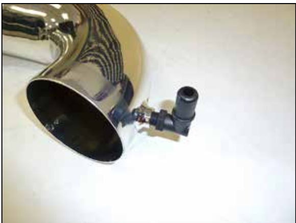
20. Install the provided 90° quick connect fitting into the K&N® intake tube as shown.