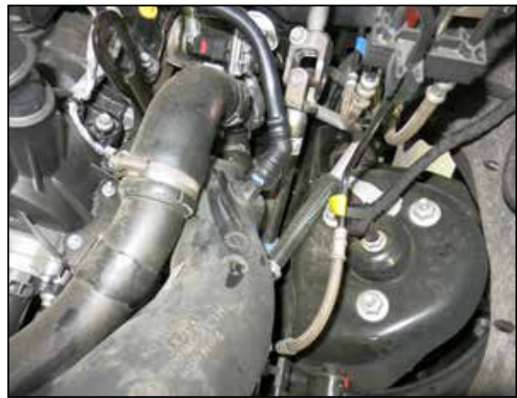
17. Reconnect the CCV hose connection.