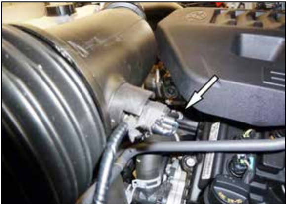
2. Disconnect the IAT sensor electrical connection.

1. Turn off the ignition and disconnect the negative battery cable. NOTE: Disconnecting the negative battery cable erases pre-programmed electronic memories. Write down all memory settings before disconnecting the negative battery cable. Some radios will require an anti-theft code to be entered after the battery is reconnected. The anti-theft code is typically supplied with your owner's manual. In the event your vehicles anti-theft code cannot be recovered, contact an authorized dealership to obtain your vehicles anti-theft code.