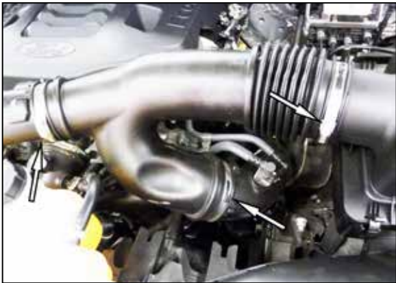
3. Loosen the three hose clamps that secure the factory intake tube and then remove the intake tube from the vehicle.