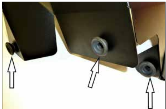
9. Remove the three mounting grommets from the factory air filter housing and install them into the heat shield as shown.