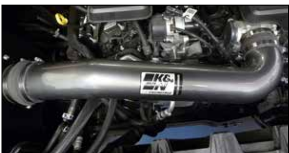
15. Install the K&N intake tube into the hump coupler and then into the step coupler at the throttle body, adjust the tube for best fit and then secure with the provided hose clamps.