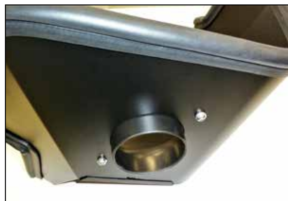
8. Install the filter adapter into the heat shield and secure with the provided hardware.