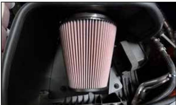
18. Install the K&N air filter onto the adapter and secure with the provided hose clamp.