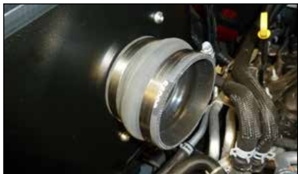
11. Install the provided hump coupler onto the filter adapter and secure with the provided hose clamp.