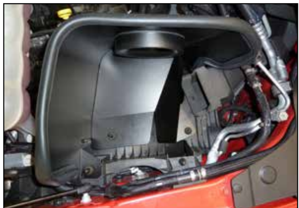
10. Install the heat shield into the vehicle so that the mounting grommets align with the mounting posts and push down.