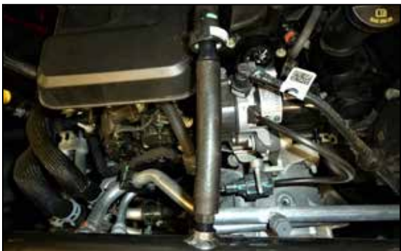
17. Install the provided quick connect fitting into the supplied CCV hose, then install the hose assembly into the factory quick connect fitting and fitting installed in the K&N intake tube.