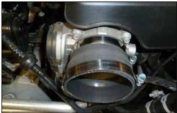
12. Install the provided step coupler onto the throttle body and secure with the provided hose clamp.