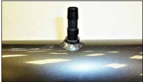
13. Install the provided CCV fitting into the K&N intake tube as shown.