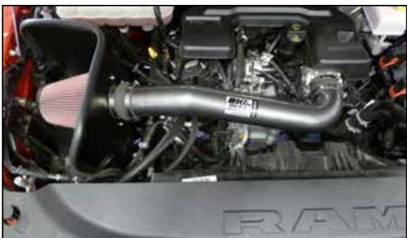
19. Reconnect the vehicle's negative battery cable. Double check to make sure everything is tight and properly positioned before starting the vehicle.