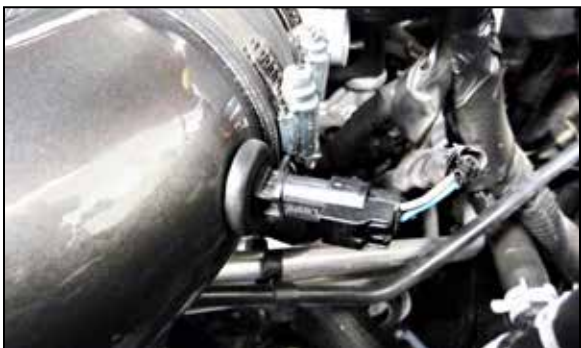
16. Reconnect the IAT sensor electrical connection.