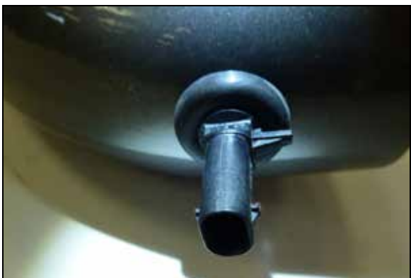
14. Remove the IAT sensor from the factory air filter housing and remove the O-ring from the sensor. Using the provided grommet, install the IAT sensor into the K&N intake tube. NOTE: The IAT sensor is very fragile, be careful while handling the sensor.