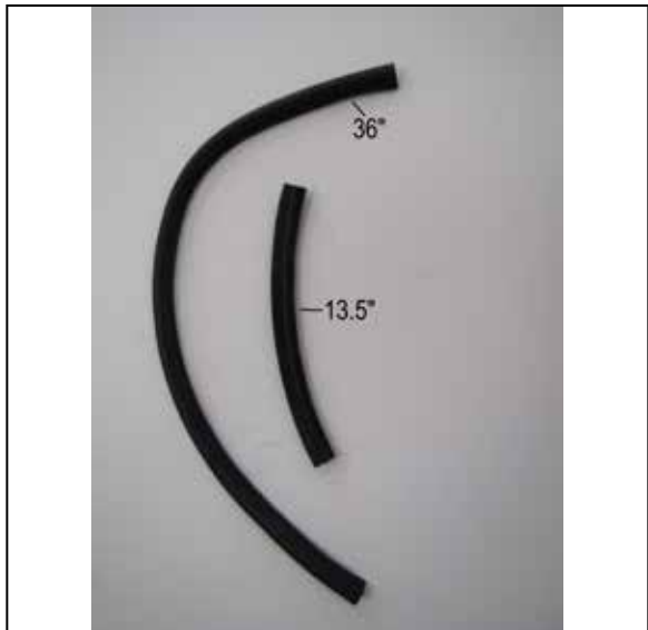
7. Cut the provided edge trim into two sections as shown.