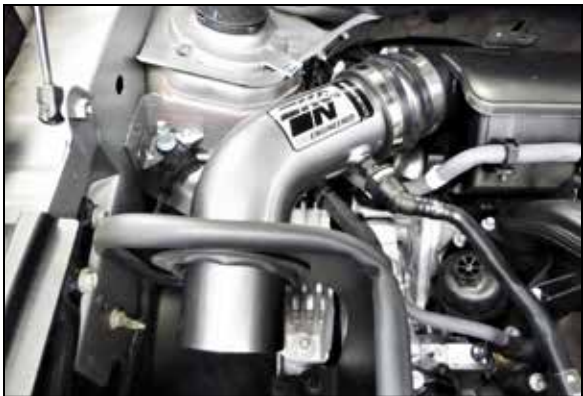
11. Install the K&N intake tube through the heat shield and then secure it to the intake plenum using the coupler and hose clamps provided.