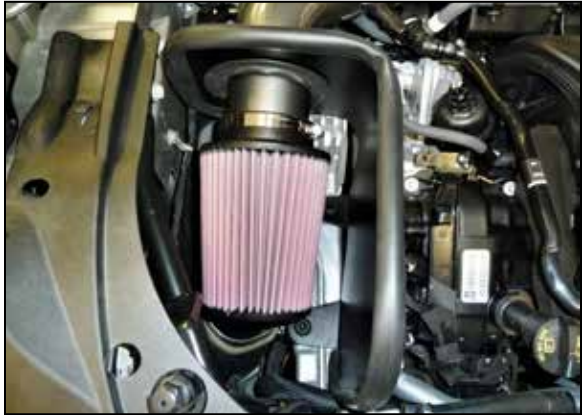
13. Install the K&N air filter onto the intake tube and secure with the provided hose clamp.