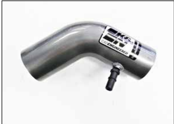
10. Install the vent fitting into the K&N intake tube as shown. NOTE: NPT fittings are easy to cross thread. Install the vent fitting "hand" tight, then turn it two complete turns with a wrench.