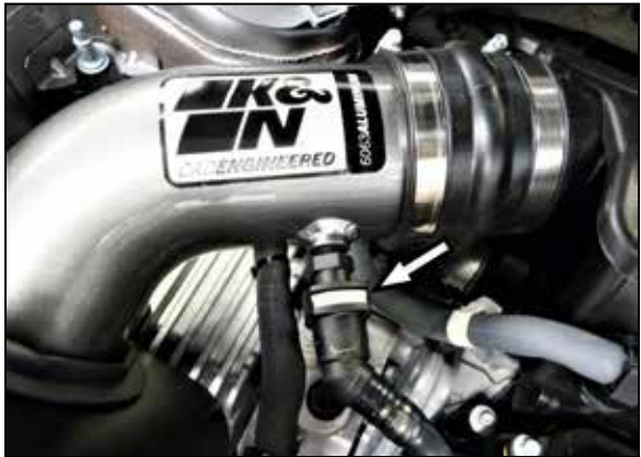
12. Connect the factory crank case vent hose to the quick connect fitting installed into the K&N intake tube.