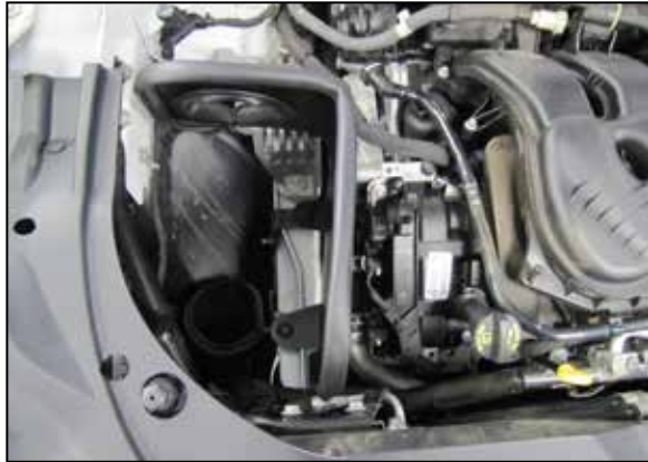
9. Install the heat shield into the vehicle so the mounting grommets and studs engage.