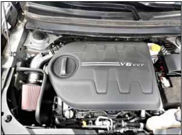
14. Reconnect the vehicle's negative battery cable. Double check to make sure everything is tight and properly positioned before starting the vehicle.