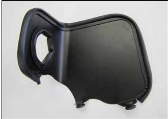
8. Install the 13.5" edge trim into the hole of the heat shield and install the 36" edge trim around the outside of the heat shield as shown.