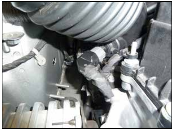
7. Disconnect the IAT sensor electrical connection.