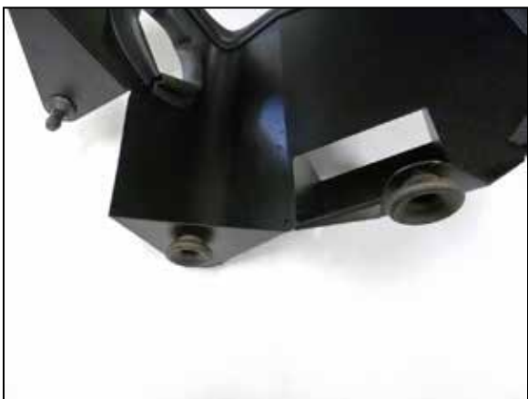
16. Install the two factory air filter housing mounting brackets onto the heat shield as shown.