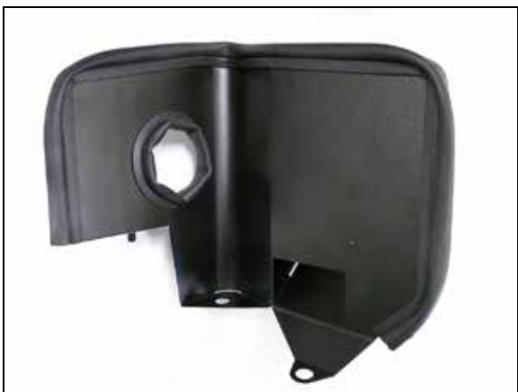
14. Install the edge trim onto the heat shield as shown.