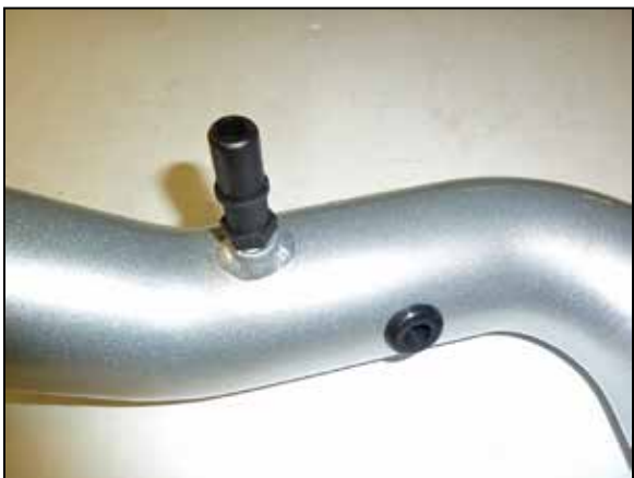
11. Install the provided grommet and quick disconnect fitting into the K&N® intake tube as shown. NOTE: NPT fittings are easy to cross thread. Install the vent fitting “hand” tight, then turn it two complete turns with a wrench.