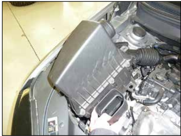
5. Pull the air filter housing straight up and remove it from the vehicle. NOTE: K&N Engineering, Inc., recommends that customers do not discard factory air intake.