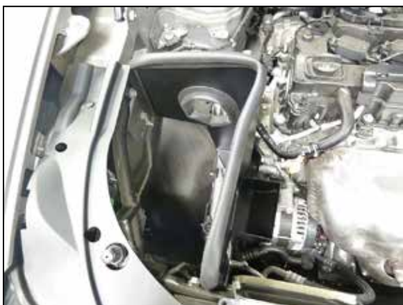
17. Install the heat shield into the vehicle as shown so the mounting studs insert into the grommets.