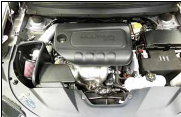
25. Reconnect the vehicle's negative battery cable. Double check to make sure everything is tight and properly positioned before starting the vehicle.