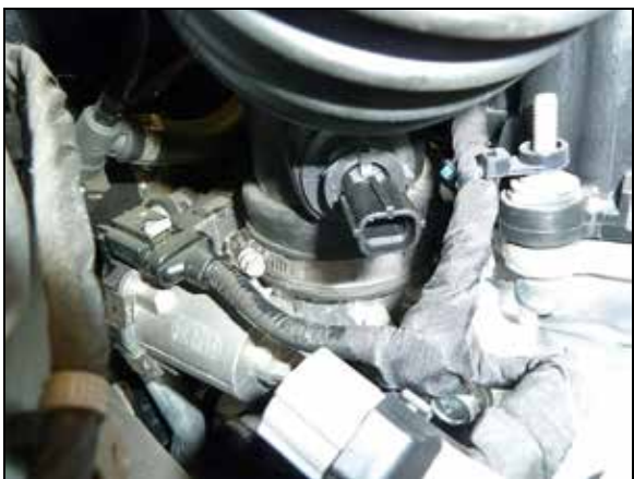
9. Loosen the hose clamp that secures the intake tube to the throttle body and then remove the intake tube from the vehicle.