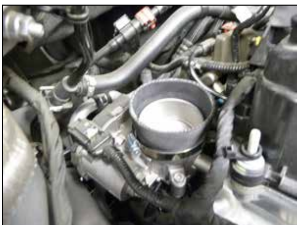
18. Install the provided coupler onto the throttle body and secure with the provided hose clamp.