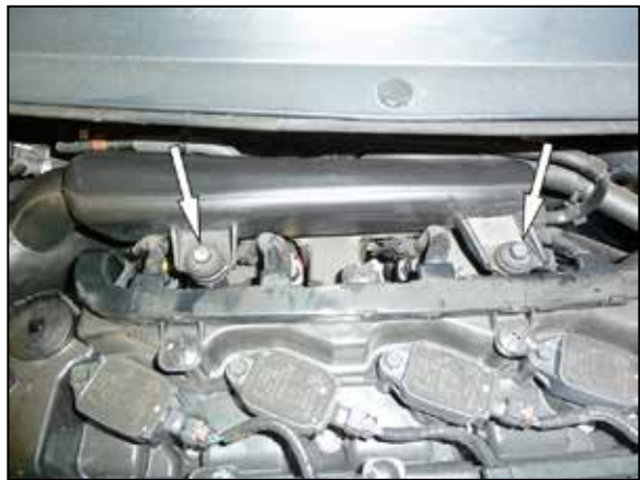
8. Remove the two bolts shown that secure the factory intake tube.