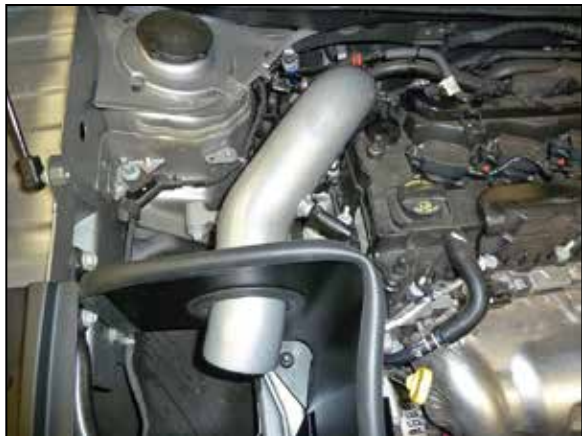
19. Install the K&N® intake tube into the heat shield and then into the coupler, adjust the tube for best fit and then secure with the provided hose clamp.