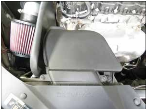
23. Reinstall the fresh air intake duct and secure with the factory hardware.