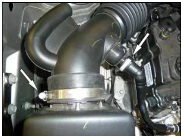
4. Push in the lock for the PCV vent and then disconnect the PCV vent from the intake tube. Loosen the hose clamp that secures the intake tube to the air filter housing and then disconnect the hose from the housing.