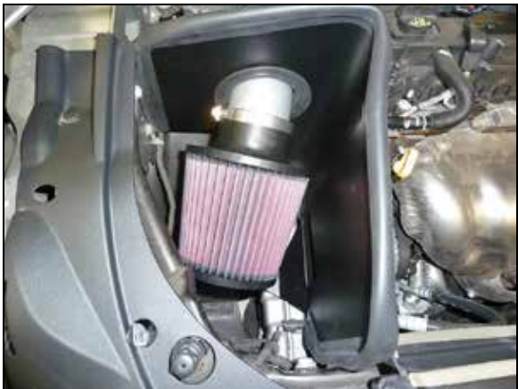
22. Install the K&N® air filter onto the intake tube and secure with the provided hose clamp. NOTE: Drycharger® air filter wrap; part # RX-4990DK is available to purchase separately. To learn more about Drycharger® filter wraps or look up color availability please visit http://www.knfilters.com ®.