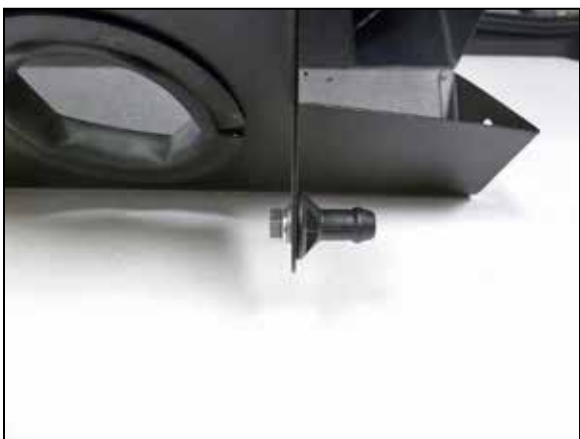
15. Install the mounting stud onto the heat shield as shown.