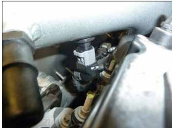
20. Reconnect the IAT sensor electrical connection.