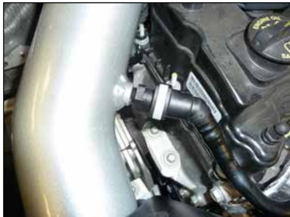
21. Reconnect the PCV to the Quick connect fitting installed into the K&N® intake tube.