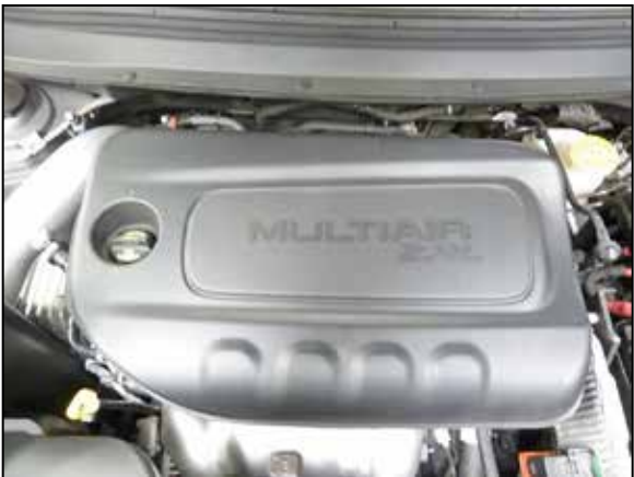
24. Reinstall the decorative engine cover.