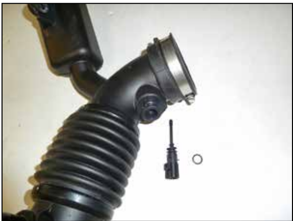
10. Remove the IAT sensor from the factory intake tube and remove the O-Ring from the sensor.