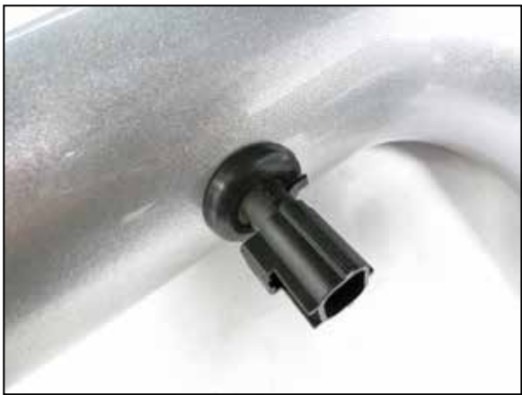
12. Install the IAT sensor into the grommet installed into the K&N® intake tube.