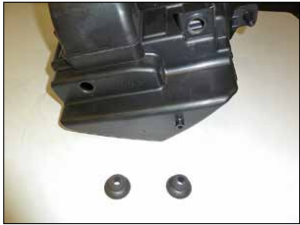
6. Remove the two mounting grommets from the factory air filter housing.