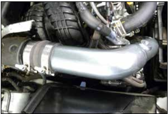
10. Install the K&N charge tube into the vehicle so the quick connect fitting engages the mating fitting, an audible click should be heard once the fitting is fully engaged. Slide the hump coupler into position and tighten the clamps.