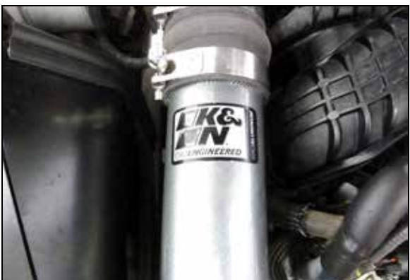
11. Install the K&N decal onto the charge tube.