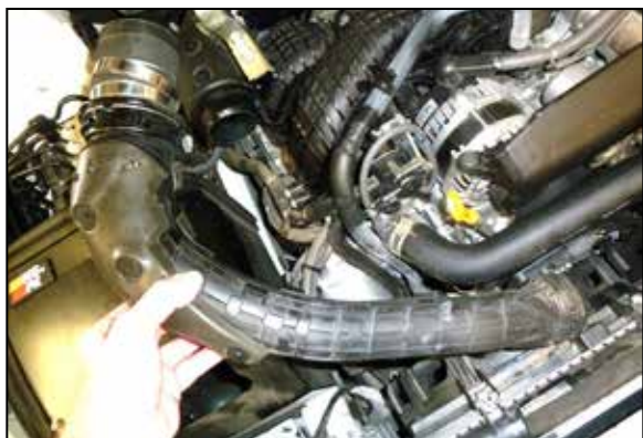
6. Remove the factory charge tube from the vehicle.