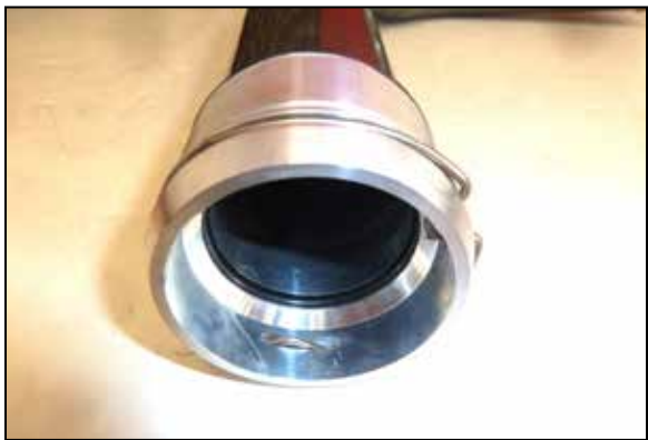
7. Remove the sealing O-ring and retaining clip from the factory charge tube and install them into the K&N charge tube.