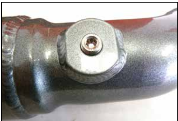
8. Install the NPT plug into the accessory port.