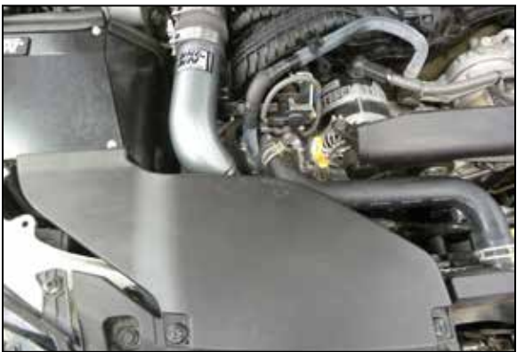
12. Reinstall the fresh air duct and clips.