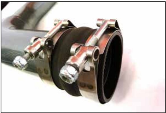
9. Install the provided hump coupler and clamps onto the K&N charge, slide the coupler all the way onto the tube.