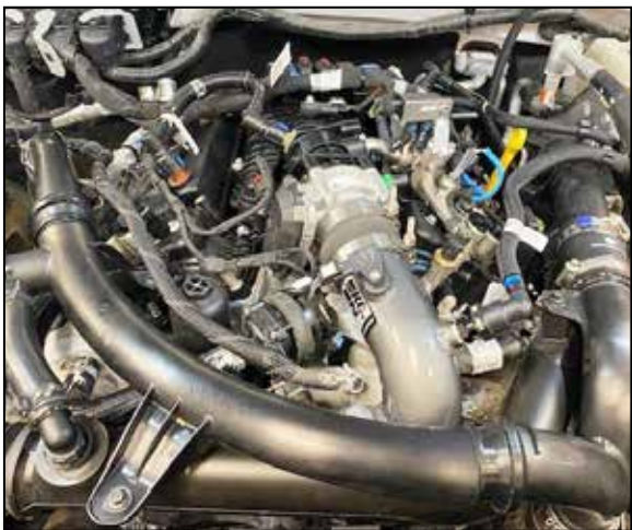
23. Reconnect the vehicle's negative battery cable. Double check to make sure everything is tight and properly positioned before starting the vehicle.

24. It will be necessary for all K&N® high flow intake systems to be checked periodically for realignment, clearance and tightening of all connections. Failure to follow the above instructions or proper maintenance may void warranty.