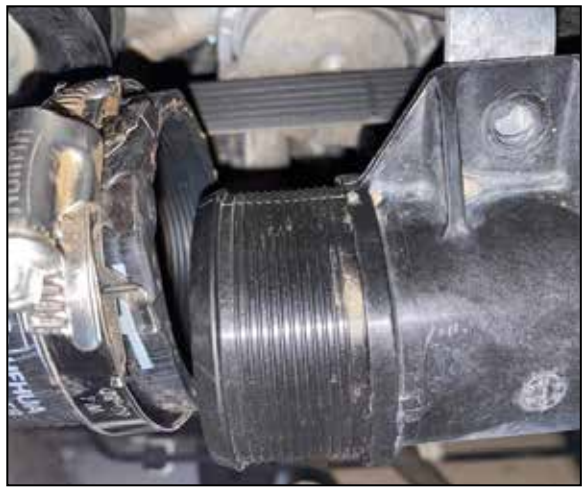
7. Remove the bolt that secures the lower section of the charge tube. Loosen the hose clamp that secures the charge tube to the intercooler and then remove the charge tube from the vehicle.