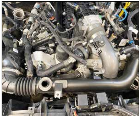
17. Reinstall the left side factory intake tube and secure the hose clamps.