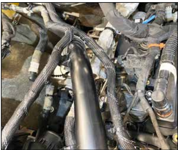
21. Reconnect the coolant lines to the hot side charge tube.