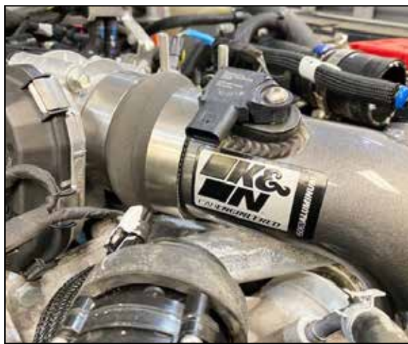
15. Install the K&N decal onto the charge tube.