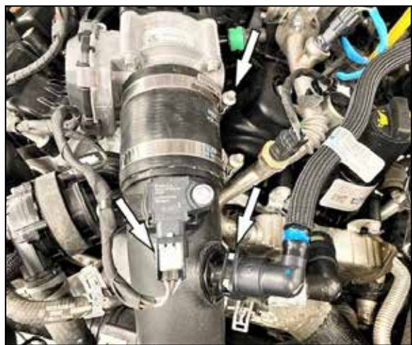
6. Disconnect the PCV quick connect fitting, disconnect the pressure sensor electrical connection, and then loosen the hose clamp securing the charge tube to the throttle body.