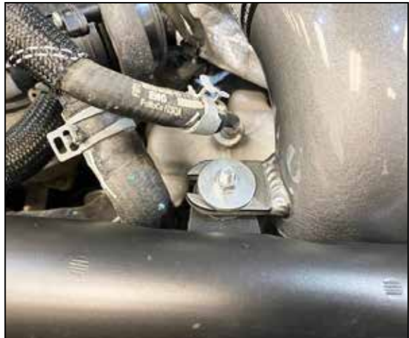
18. Secure the factory intake tube and K&N charge tube using the provided hardware.