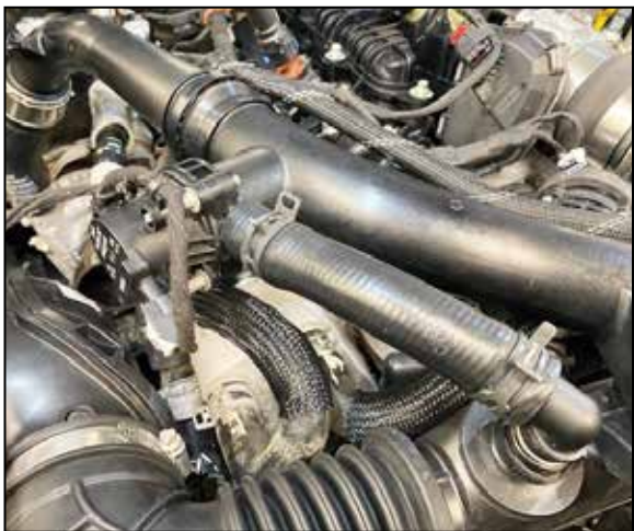
20. Reconnect the BOV quick connect fitting and then reconnect the BOV electrical connection and secure the wiring harness.