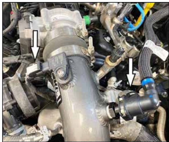
16. Reconnect the pressure sensor electrical connection and connect the PCV hose quick connect fitting.