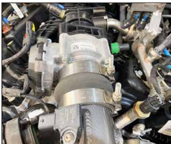
14. Secure the clamps that secure the hump coupler to the charge tube and throttle body.