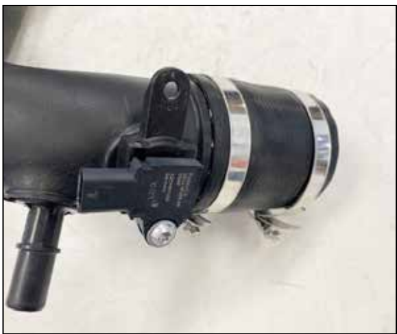
8. Remove the pressure sensor from the factory charge tube.