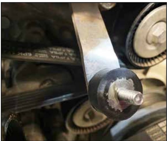
10. Install the provided rubber mounted stud onto the lower mounting bracket.