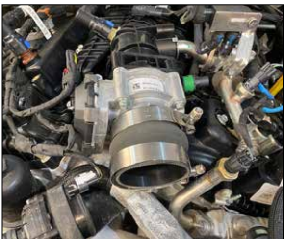
11. Install the provided hump coupler onto the throttle body and secure with the provided clamp.