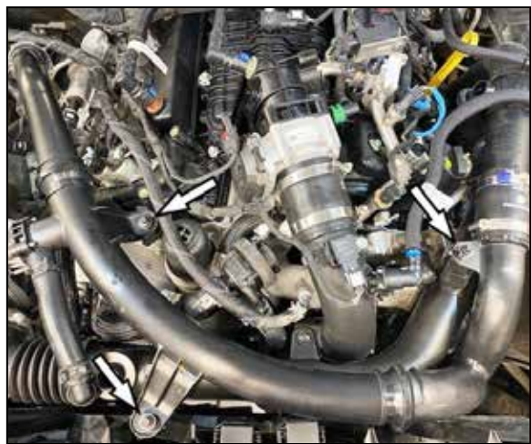
4. Remove the three mounting bolts securing the factory charge tube to the engine. Loosen the hose clamp that secures the right side of the charge tube and then release the two spring clamps and remove the factory charge tube from the vehicle.