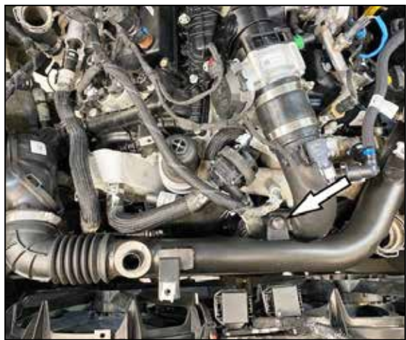
5. Remove the bolt that secures the intake tube to the engine, then loosen the two hose clamps and remove the intake tube from the vehicle.