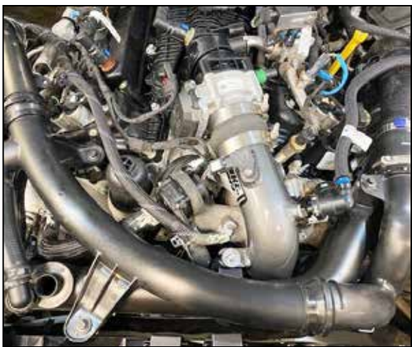
19. Reinstall the factory hot side charge tube and secure the factory clamps and hardware.