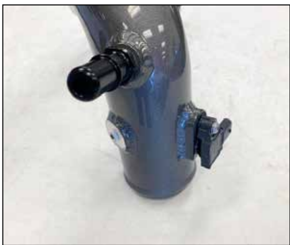
9. Install the pressure sensor into the K&N charge tube and secure with the provided hardware. Apply thread sealant to the 1/8npt plug and then install the plug into the K&N charge tube. Apply thread sealant to the threads of the provided quick connect fitting and then install the fitting into the K&N charge tube.