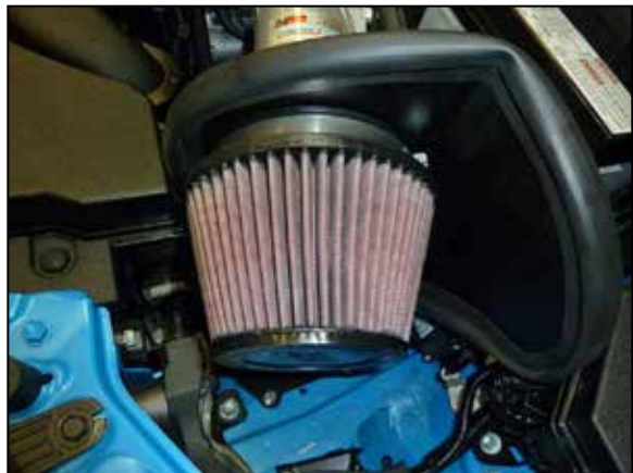
22. Install the K&N® air filter and secure with the hose clamp.