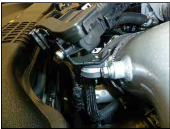
20. Insert the solenoid bracket into the cushion clamp.