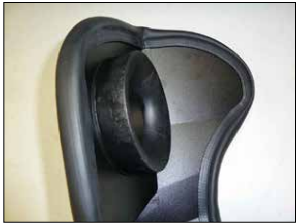
10. Install the radius filter adapter into the heat shield and secure with the provided hardware.