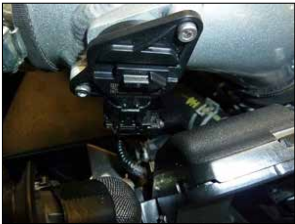
21. Reconnect the mass air sensor electrical connection.