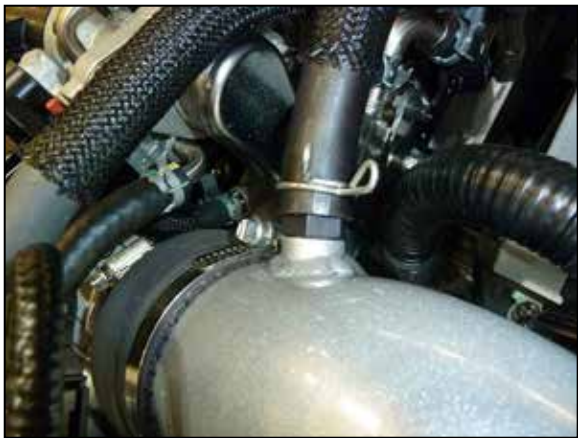
19. Connect the PCV hose to the fitting installed into the K&N® intake tube and secure with the factory spring clamp.