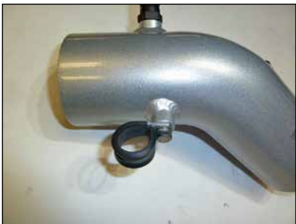
17. Install the provided cushion clamp onto the K&N® intake tube using the provided hardware.