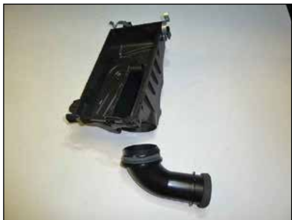
7. Separate the fresh air intake duct from the lower air filter housing.