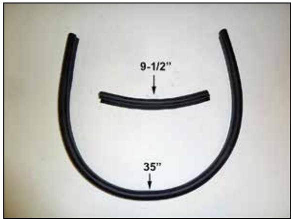
8. Cut the provided edge trim into sections of 9-1/2" and 35" long.