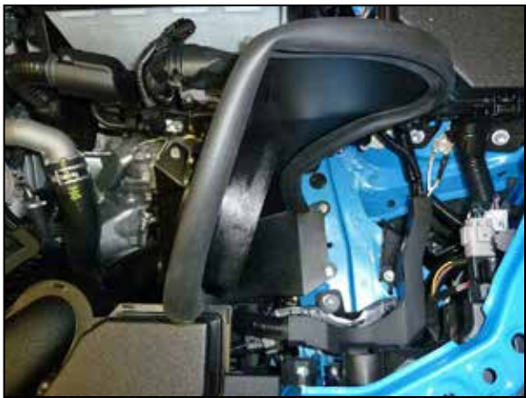
13. Install the heat shield assembly into the vehicle and secure with the provided hardware.