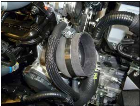
14. Install the provided coupler (08421) onto the throttle body and secure with the provided hose clamp.