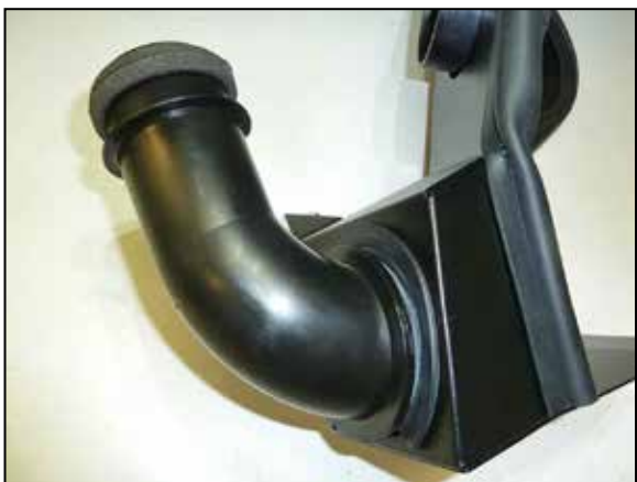
12. Install the 9-1/2" edge trim into the fresh air intake hole of the heat shield and then install the factory fresh air duct into the heat shield as shown.