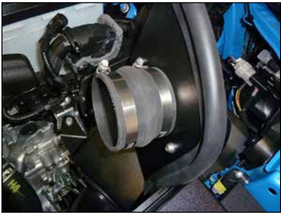
15. Install the provided hump coupler (087121) onto the filter adapter and secure with the provided hose clamp.