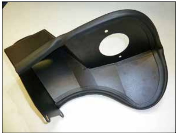
9. Install the 35" section around the outside of the heat shield.