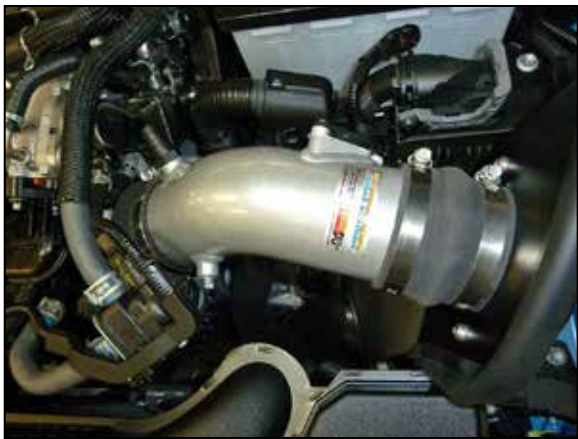
18. Install the intake tube into the couplers, adjust for best fit and then secure with the provided clamps.