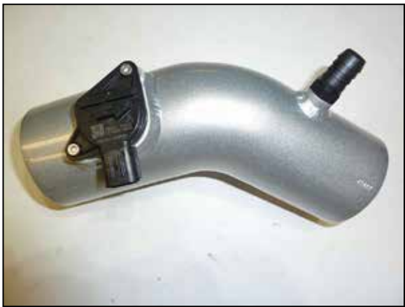
16. Remove the mass air sensor from the factory housing and install it into the K&N® intake tube and secure with the provided hardware. Install the vent fitting into the K&N® intake tube as shown. NOTE: NPT fitting has tapered threads and only designed to be installed until hand tight, then tighten one rotation or when the fitting becomes difficult to return.