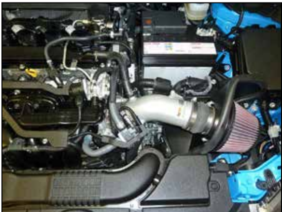
23. Reconnect the vehicle's negative battery cable. Double check to make sure everything is tight and properly positioned before starting the vehicle.

24. It will be necessary for all K&N® high flow intake systems to be checked periodically for realignment, clearance and tightening of all connections. Failure to follow the above instructions or proper maintenance may void warranty.