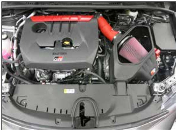
23. Reconnect the vehicle's negative battery cable. Double check to make sure everything is tight and properly positioned before starting the vehicle.