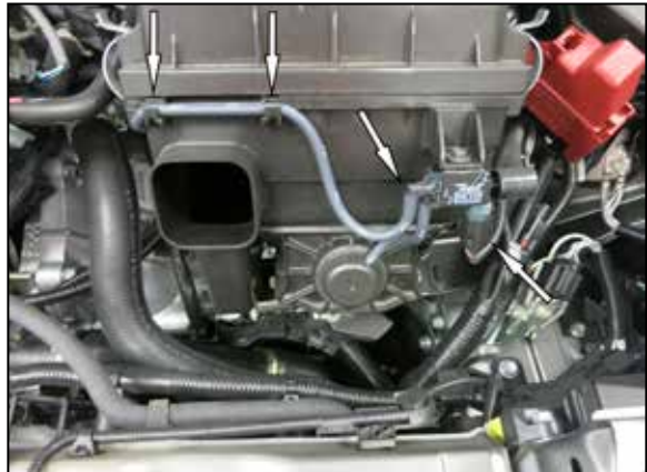
5. Disconnect the vacuum switch electrical connection and then disconnect the vacuum line shown and unhook it from the air filter housing.