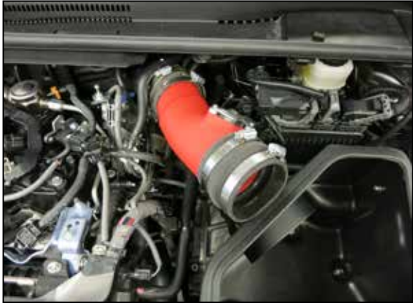
17. Install the tube assembly onto the turbo inlet by sliding the coupler onto the turbo, then align the tube and coupler with the filter adapter, adjust the tube and couplers for best fit and then secure all the hose clamps.