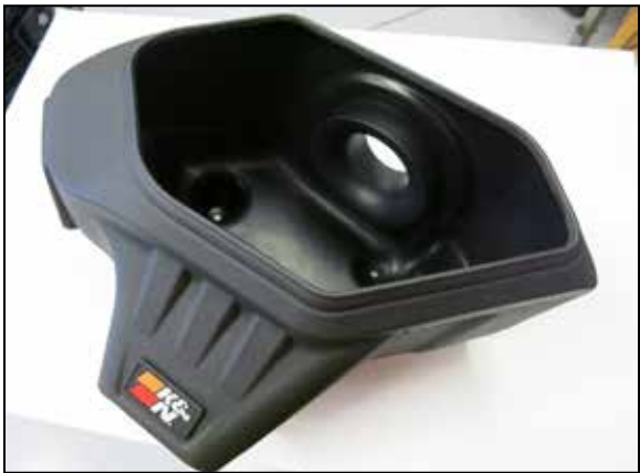
9. Install the filter adapter into the K&N air filter housing and secure with the provided hardware. Snap the K&N badge into the air filter housing.