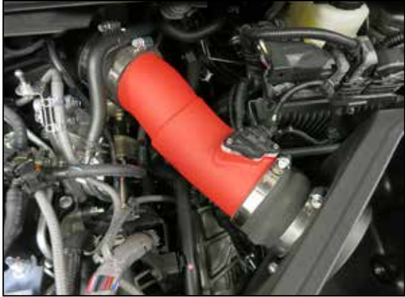
18. Reconnect the mass air sensor electrical connection.