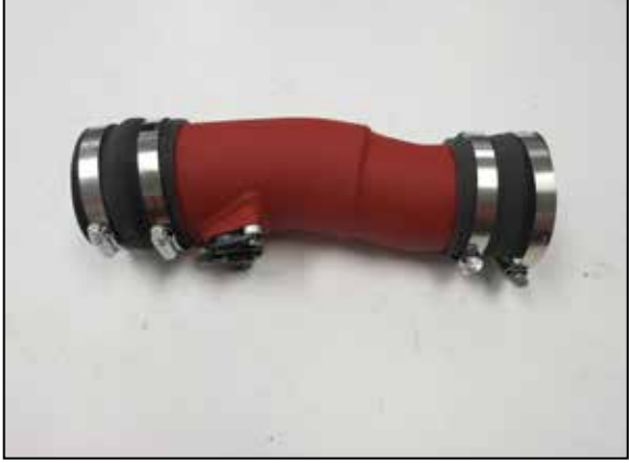
16. Install the provided couplers onto the K&N intake tube as shown, do not secure the couplers at this time.