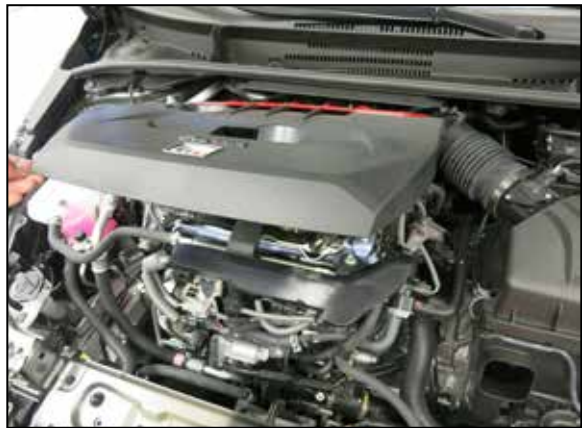
4. Lift off the engine cover.