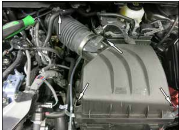
6. Loosen the hose clamp that secures the intake tube to the turbo inlet, Disconnect the mass air sensor electrical connection, release the spring clamps that secure the upper air filter housing and then remove the assembly from the vehicle.