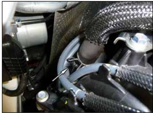
21. Release the spring clamp the secures the CCV hose to the turbo inlet tube and then disconnect the ccv hose from the tube.