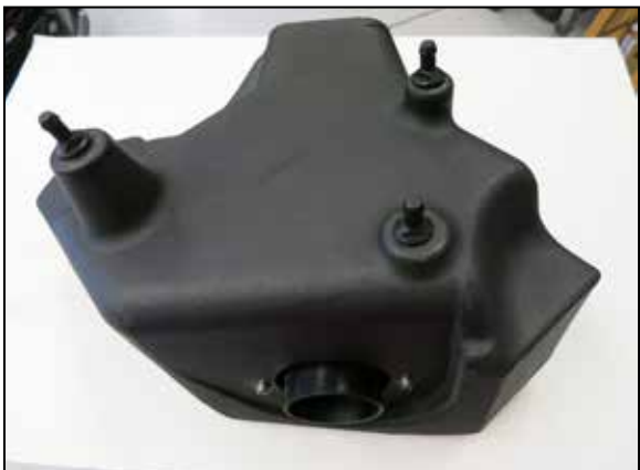
10. Install the three mounting studs into the K&N air filter housing using the provided hardware.