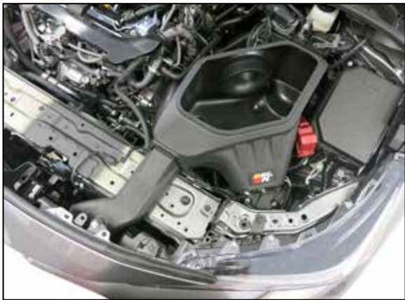
14. Set the K&N air filter housing into position, insert the duct into the air filter housing and then install the housing so the mounting studs insert into the factory housing mounting grommets.