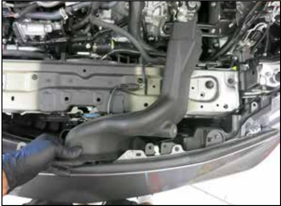
13. Feed the K&N fresh air duct over the core support down in behind the grill opening and then secure with the provided bolt. NOTE: releasing the hood latch allows for easier access while installing the duct behind the grill.