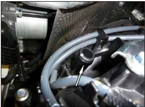
22. Install the provided CCV insert into the turbo inlet tube CCV port, note the position of the CCV insert in photo. The angled opening is to be towards the passenger side of the vehicle. Reconnect the CCV hose and secure with the factory spring clamp. Reinstall the engine cover. NOTE: in the second photo the mark on the top lip of the CCV insert aligns with the short side of the angle cut. This mark is in the photo for reference only, it is not on the CCV insert provided.