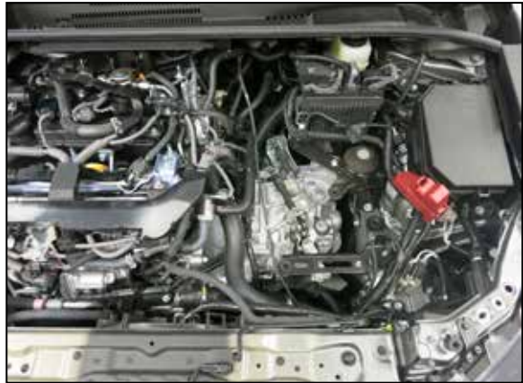
7. Lift up and remove the lower air filter housing.