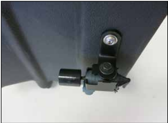
12. Secure the switch assembly to the K&N air filter housing using the provided hardware.