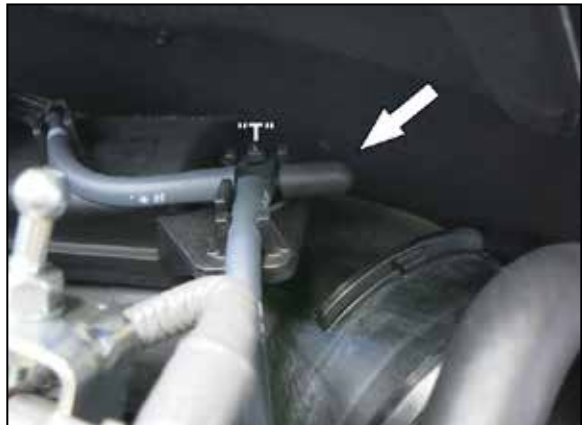
8. Remove the long vacuum line that routes to the vacuum switch and to the “T” fitting. Remove, and cap off the “T” using provided rubber cap.