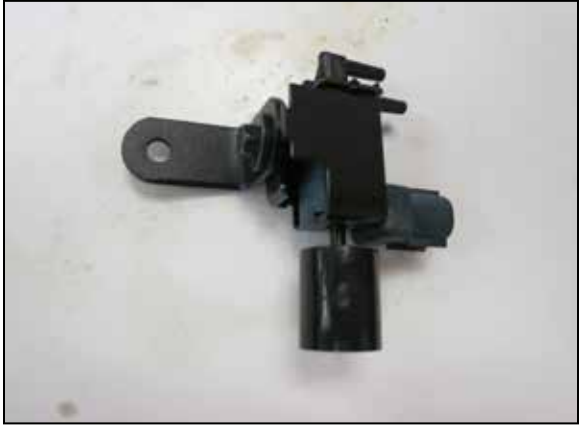
11. Remove the vacuum switch from the factory air filter housing and then secure the provided “L” bracket to the switch using the factory mounting bolt.