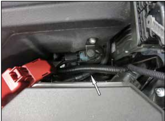
15. Reconnect the vacuum switch electrical connection.