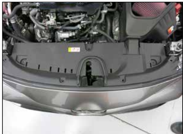
20. Reinstall the radiator valence and secure with the factory plastic pins.