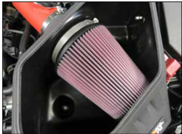
19. Install the air filter onto the filter housing and secure with the provide hose clamp.