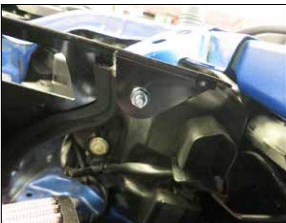
23. Secure the heat shield to the vibration damper using the factory nut.