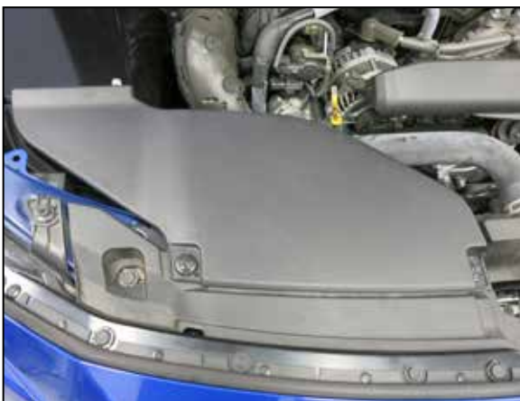
26. Reinstall the fresh air duct and secure with the factory mounting pins.