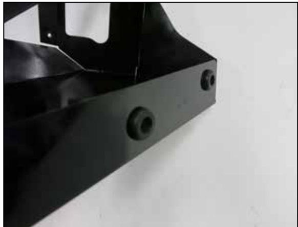
20. Install the provided grommets into the base of the heat shield as shown.