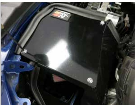
25. Install the lid onto the heat shield and secure with the provided hardware.