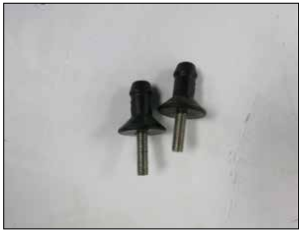
19. Install the provided m6 studs into the provided mounting posts.