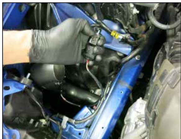
16. Install the K&N intake tube into the coupler at the turbo and align the mounting bracket with the vibration damper. Connect the provided extension harness to the mass air sensor and then connect the other end to the factory harness.