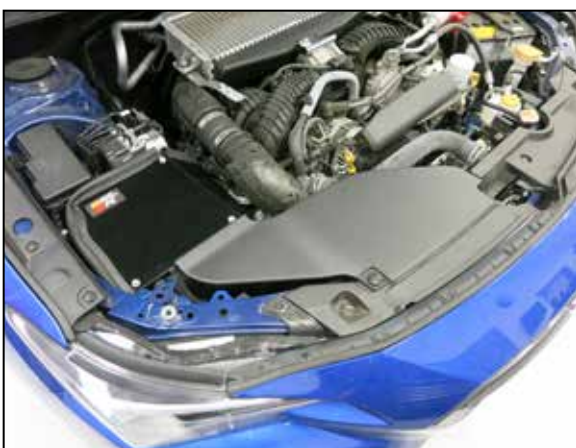
27. Reconnect the vehicle's negative battery cable. Double check to make sure everything is tight and properly positioned before starting the vehicle.

28. It will be necessary for all K&N® high flow intake systems to be checked periodically for realignment, clearance and tightening of all connections. Failure to follow the above instructions or proper maintenance may void warranty.