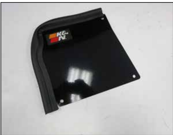
24. Install the remaining 15" edge trim onto the lid as shown. Install the K&N badge and secure with the backing plate.