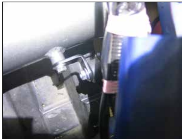
17. Secure the mounting bracket to the vibration damper using the factory nut. Tighten the hose clamps at the turbo.