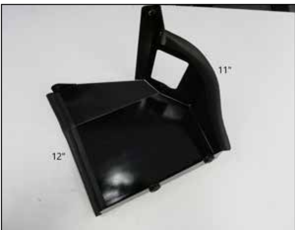
21. Cut the provided edge trim into lengths of 11", 12" and 15". Install the 11" and 12" onto the heat shield as shown.