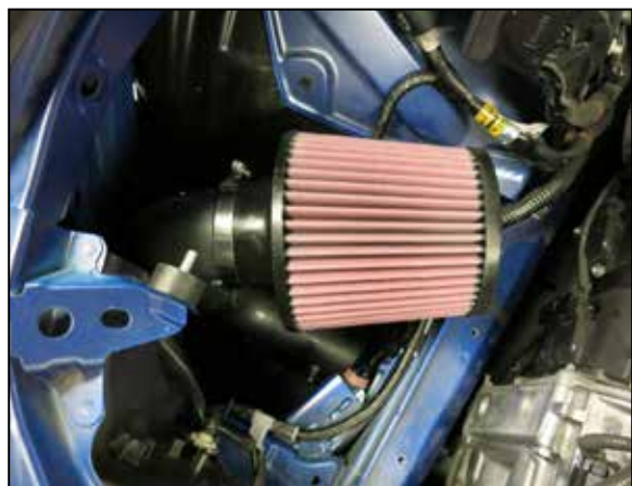
18. Install the K&N air filter onto the intake tube and secure with the provided hose clamp.