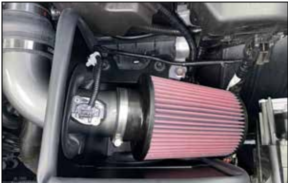
14. Install the K&N filter onto the intake tube and secure with the provided hose clamp. Reconnect the mass air sensor electrical connection.