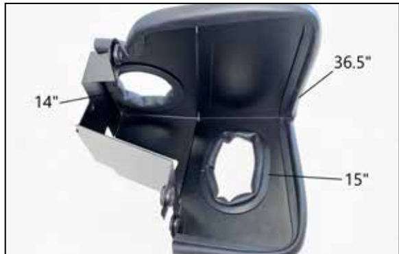
7. Install the edge trim from the previous step onto the heatshield as shown.