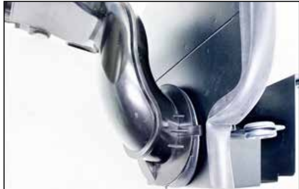
9. Install the fresh air intake duct into the K&N heatshield.