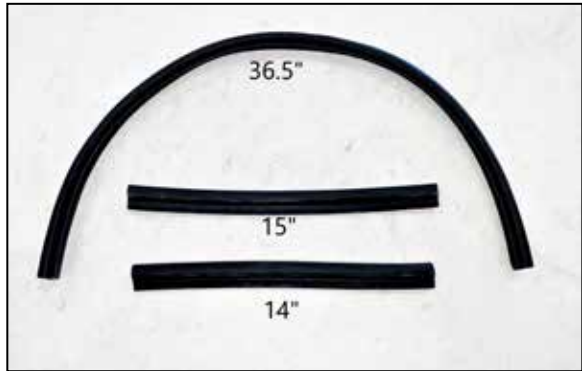
6. Cut the provided edge trim into sections as shown.