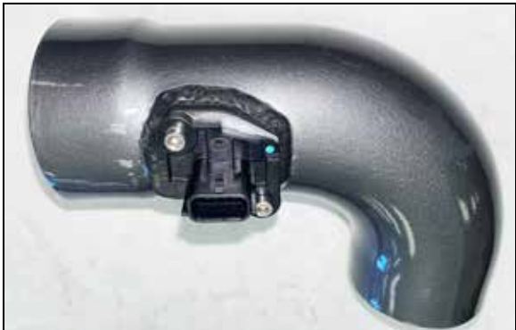
12. Remove the mass air sensor from the factory air filter housing and then install it into the K&N intake tube. Secure the sensor with the provided hardware.