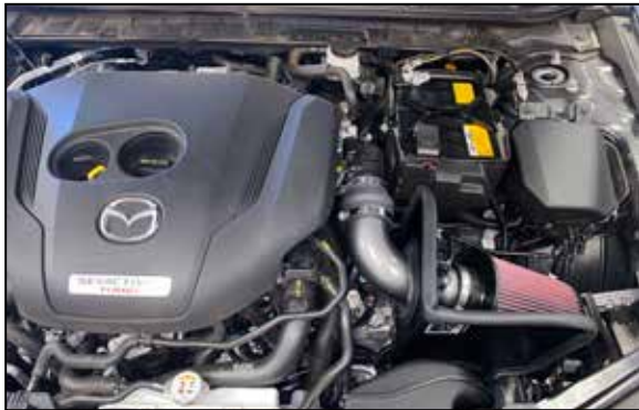
17. Reconnect the vehicle's negative battery cable. Double check to make sure everything is tight and properly positioned before starting the vehicle.