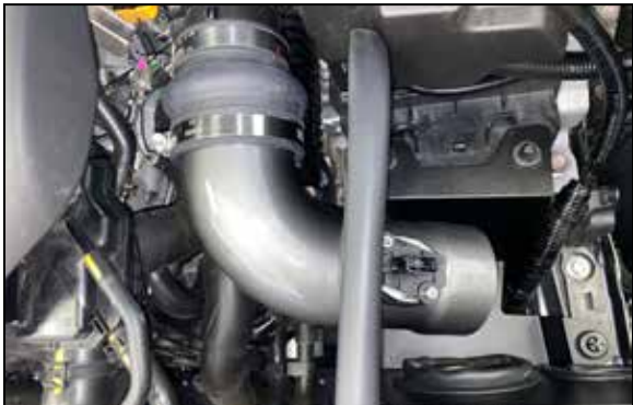
13. Install the intake tube assembly through the hole in the heatshield and then into the hump coupler and secure with the provided hose clamp.