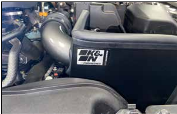
15. Apply the provided K&N decal onto the heatshield.