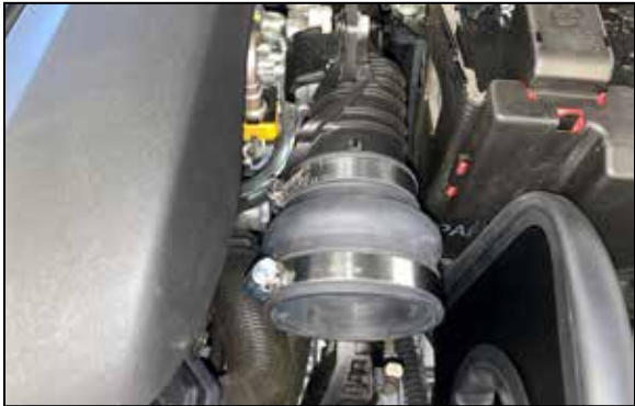
11. Install the provided hump coupler onto the turbo inlet and secure with the provided hose clamp.