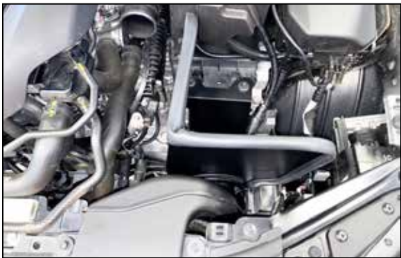
10. Install the heatshield assembly into the vehicle so the mounting posts insert into the grommets. Secure the fresh air duct with the factory hardware.