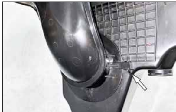
8. Release the tab that locks the fresh air duct onto the factory air filter housing, rotate the duct counterclockwise and then remove from the housing.