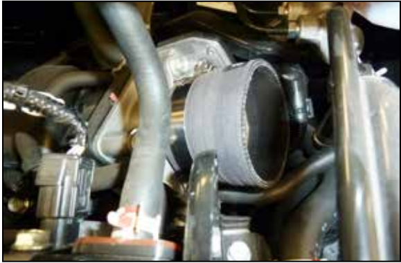
10. Install the straight coupler onto the throttle body and secure with the provided hose clamp.