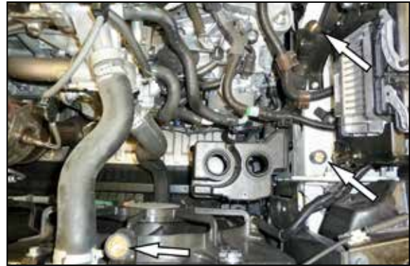
6. Install the three rubber mounted studs provided into the factory air box mounting locations.