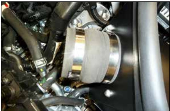
9. Install the hump coupler onto the filter adapter and secure with the provided hose clamp.