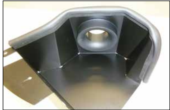
7. Install the filter adapter into the heat shield using the provided hardware and then install the edge trim onto the heat shield as shown.