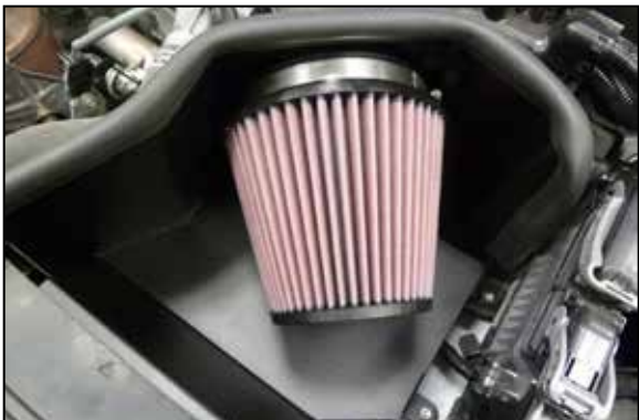
14. Install the K&N air filter onto the filter adapter and secure with the provided hose clamp.