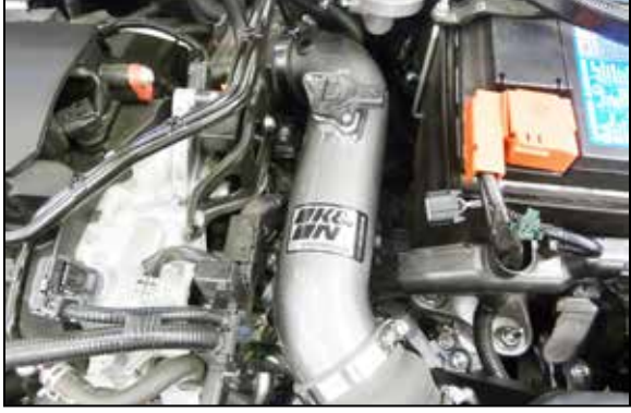
12. Install the K&N intake tube into the coupler, adjust for best fit and then secure with the provided hose clamps. Install the K&N badge onto the intake tube as shown.