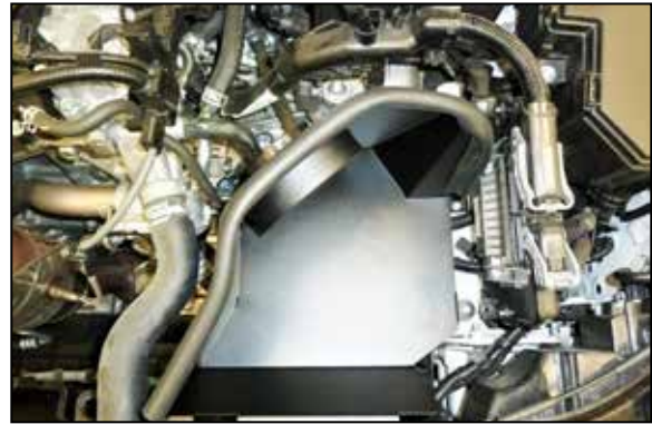
8. Install the heat shield onto the rubber mounted studs installed previously and secure with the provided hardware.