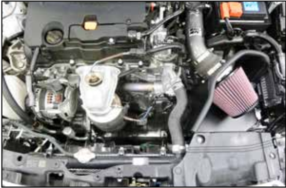
15. Reconnect the vehicle's negative battery cable. Double check to make sure everything is tight and properly positioned before starting the vehicle.

16. It will be necessary for all K&N® high flow intake systems to be checked periodically for realignment, clearance and tightening of all connections. Failure to follow the above instructions or proper maintenance may void warranty.