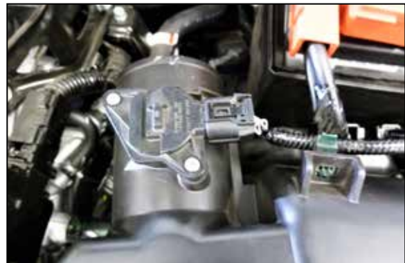
4. Disconnect the mass air sensor electrical connection.