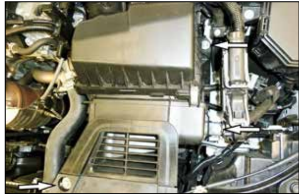
5. Remove the three bolts that secure the factory air filter housing and fresh air duct and then remove the assembly from the vehicle.