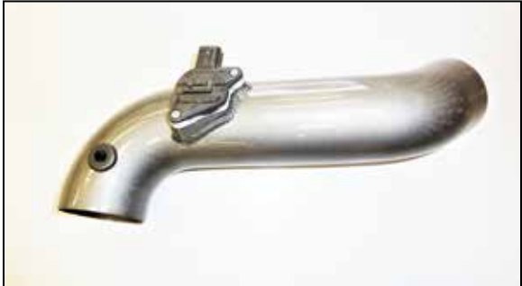
11. Remove the mass air sensor from the factory housing and then install it into the K&N intake tube using the factory screws. Install the provided PCV grommet into the K&N intake tube as shown. Note: Early model use grommet with smaller hole. Later models use grommet with larger hole.