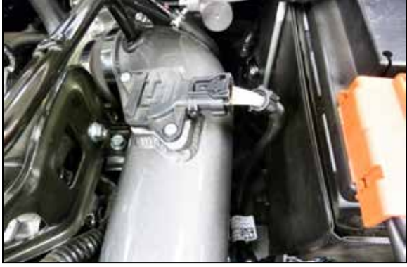
13. Reconnect the mass air sensor electrical connection.