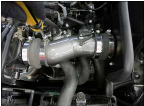
16. Install the intake tube assembly into the vehicle, position the couplers and adjust for best fit. Secure the assembly with the provided hose clamps.