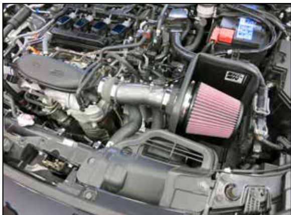
21. Reconnect the vehicle's negative battery cable. Double check to make sure everything is tight and properly positioned before starting the vehicle.

22. It will be necessary for all K&N® high flow intake systems to be checked periodically for realignment, clearance and tightening of all connections. Failure to follow the above instructions or proper maintenance may void warranty.