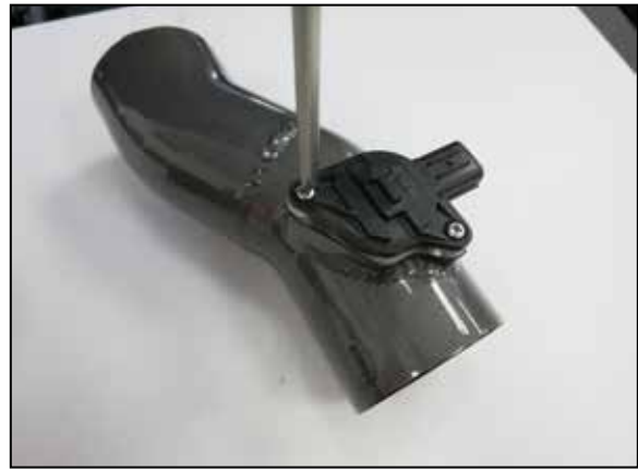
13. Remove the mass air sensor from the factory housing and install it into the K&N intake tube and secure with the factory screws.