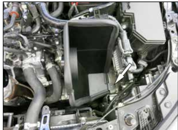
12. Install the heat shield assembly into the vehicle so the grommet aligns with the mounting stud and then secure the heat shield with the hardware provided.