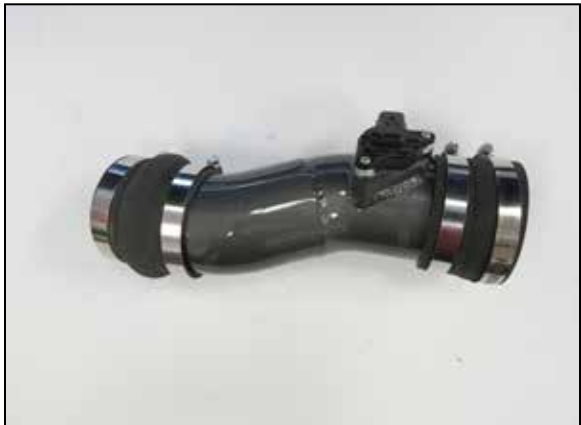
15. Install the step coupler and hump coupler onto the K&N intake tube as shown.