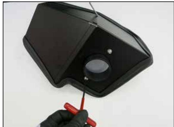
10. Install the filter adapter into the heat shield and secure with the provided hardware.