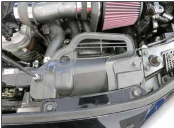
19. Install the factory fresh air duct and secure with the factory hardware.