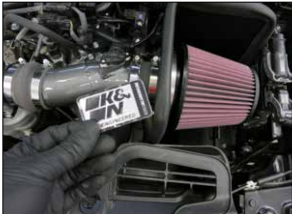
20. Apply the K&N badge to the K&N heat shield as shown.