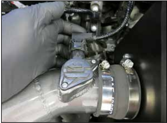
17. Reconnect the mass air sensor electrical connection.