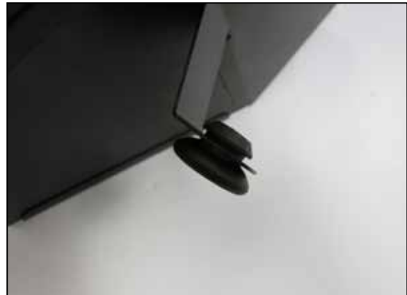
11. Remove the mounting grommet from the rear of the factory lower air filter housing and install it into the heat shield.