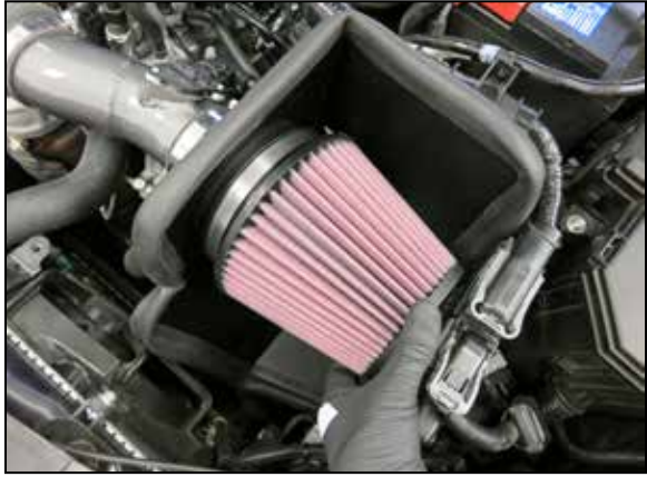
18. Install the K&N air filter onto the filter adapter and secure with the provided hose clamp.