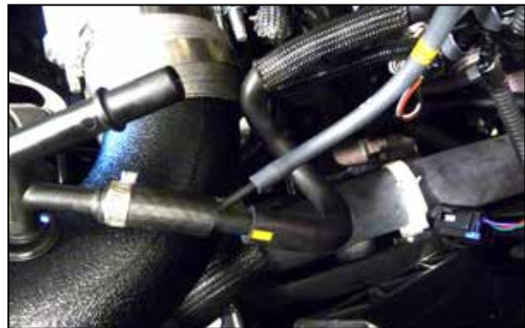
20. Install the intake hose assembly onto the turbo inlet. Connect the vent hoses from step #11 and #12 to the vacuum fitting as shown.