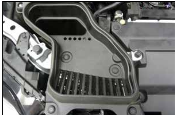
31. Reinstall the factory fresh air duct and secure with the factory pins. NOTE: Land Cruiser models do not use the under hood fresh air duct, skip to the next step.