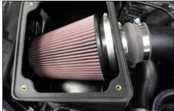
29. Install the K&N air filter onto the filter adapter and secure with the provided hose clamp.