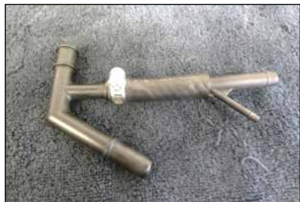
18. Assemble the provided Ejector fitting, vacuum hose & vacuum fitting as shown.