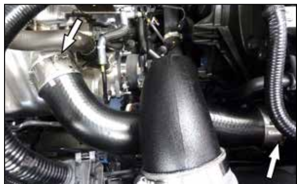
24. Reinstall the charge tube and secure with factory retaining clips.