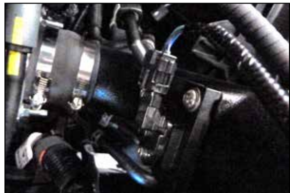
27. Reconnect the MAF sensor electrical connection.