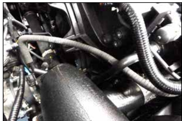
26. Install the vent hose onto the ejector fitting installed into the K&N intake tube and then connect the open end onto the charge tube fitting.