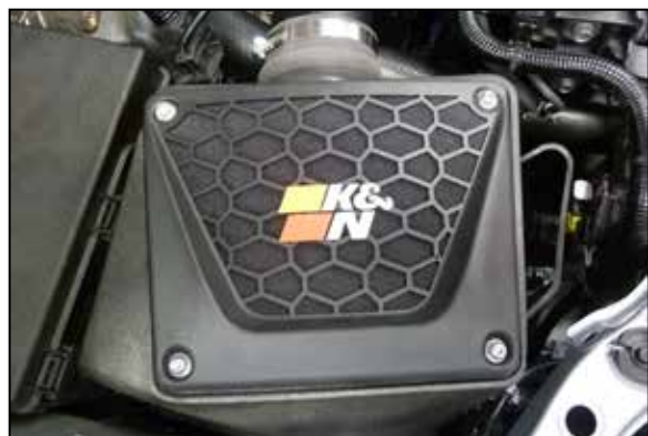
30. Assemble the pre-filter lid and install it onto the K&N air filter housing using the provided hardware.