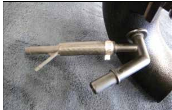
19. Install the Ejector fitting assembly into the K&N intake tube using the provided grommet.