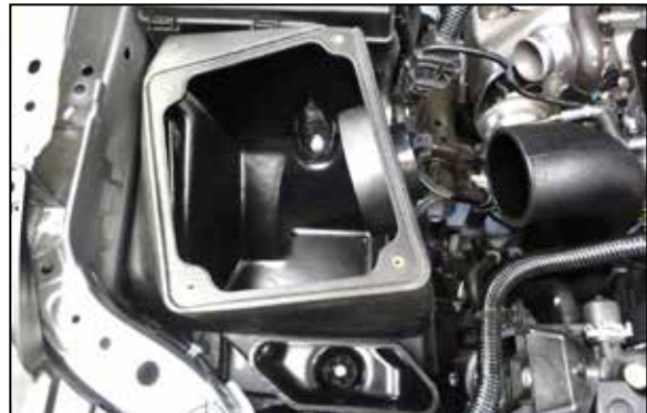
22. Install the K&N air filter housing assembly into the vehicle and secure with the provided hardware. NOTE: On Land Cruiser models, install the provided block-off plug onto the under hood fresh air duct inlet.