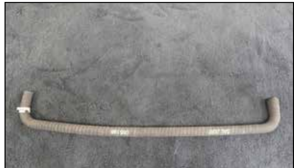
25. Install the factory spring clamp from step #8 onto the small end of the provided vent hose.