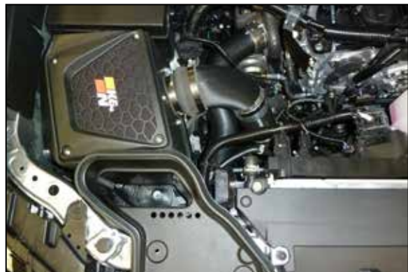
32. Reconnect the vehicle's negative battery cable. Double check to make sure everything is tight and properly positioned before starting the vehicle.

33. It will be necessary for all K&N® high flow intake systems to be checked periodically for realignment, clearance and tightening of all connections. Failure to follow the above instructions or proper maintenance may void warranty.