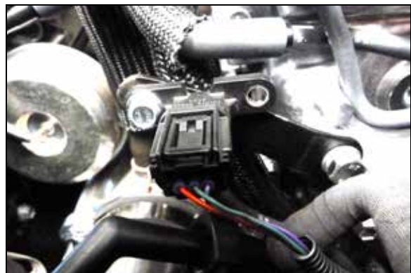
28. Using the provided bracket and hardware, mount the vacuum sensor to the engine as shown and then connect the vacuum line from the tee fitting connected to the ejector fitting. NOTE: The bracket/sensor may have to be rotated or positioned properly allowing the harness to be connected.