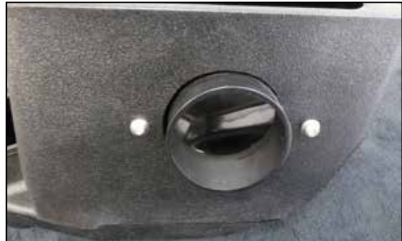
21. Install the filter adapter into the K&N air filter housing and secure with the provided hardware.