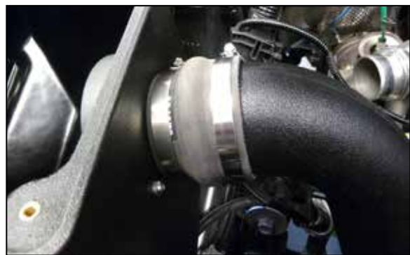
23. Install the provided hump coupler onto the intake tube and filter adapter, align for best fit and then secure with the provided hose clamps.