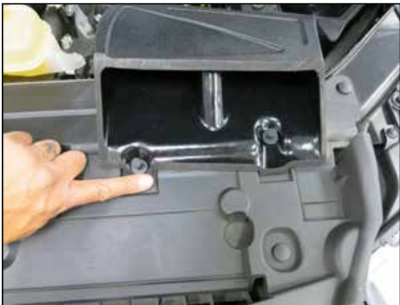
14. Secure the fresh air intake duct with the provided push pins.