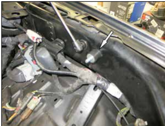
11. Install the provided rubber mounted stud into the inner fender at the air filter housing mounting location.