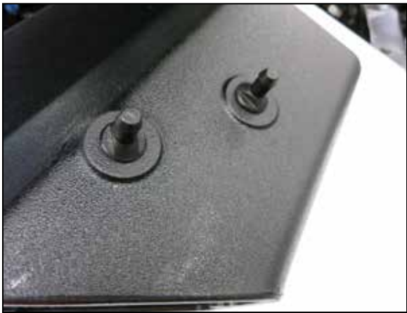
9. Install the provided mounting studs onto the K&N lower air filter housing using the provided hardware.