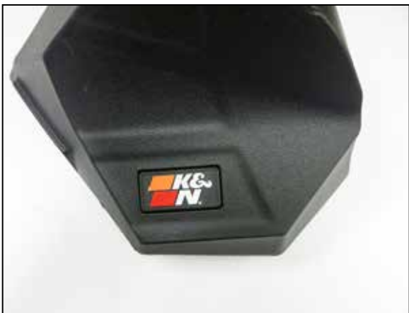
15. Snap the K&N badge into the upper air filter housing.