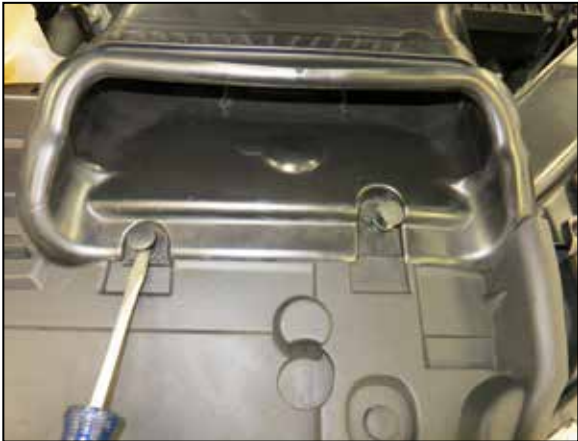
5. Pry up the push-pin locks that secure the fresh air intake duct and remove the pins.