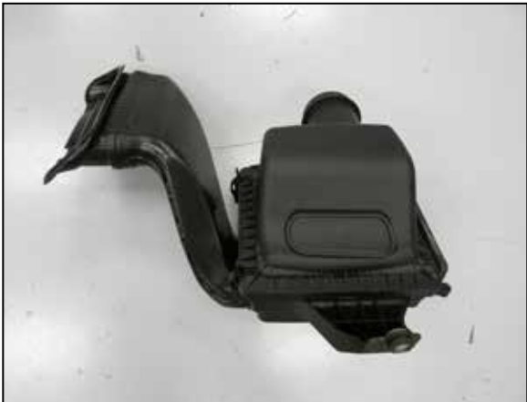
7. Remove the air filter housing/fresh air intake duct assembly from the vehicle.