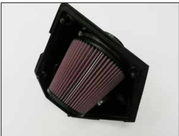
17. Install the K&N air filter onto the adapter and secure with the provided hose clamp.