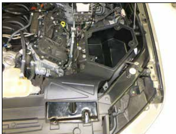
12. Install the K&N lower air filter housing assembly into the vehicle.