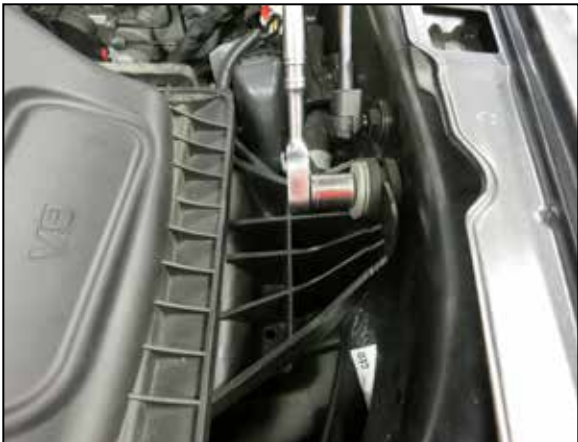
6. Remove the bolt that secures the factory air filter housing to the inner fender.