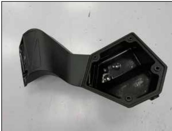
10. Install the K&N fresh air duct onto the K&N lower air filter housing using the provided hardware.