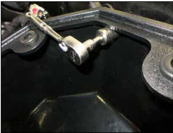
13. Secure the housing to the rubber mounted stud from step #11 with the provided hardware.