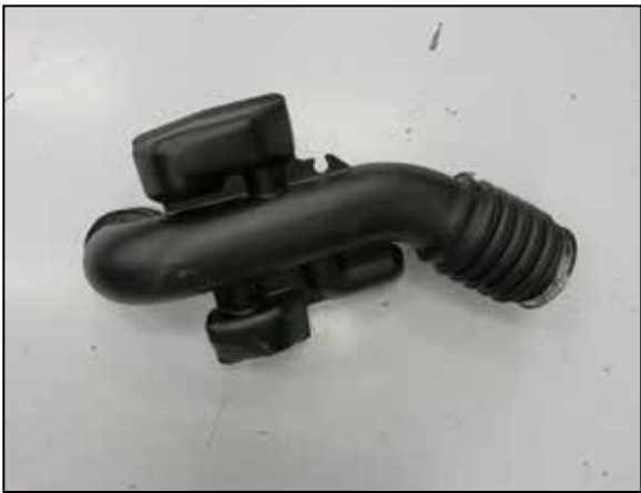
4. Remove the intake tube from the vehicle.