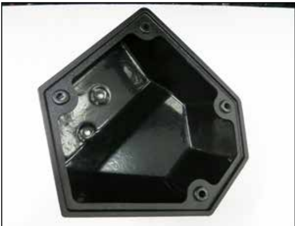
8. Install the provided grommets into the K&N lower air filter housing.