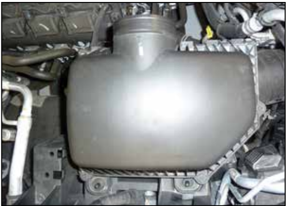
5. Pull the air filter housing up and remove it from the vehicle.