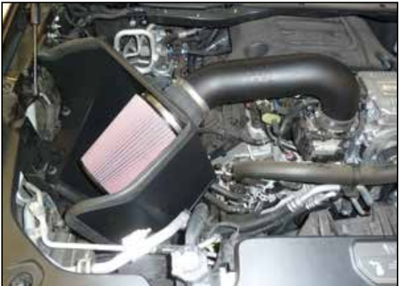
16. Reconnect the vehicle's negative battery cable. Double check to make sure everything is tight and properly positioned before starting the vehicle.