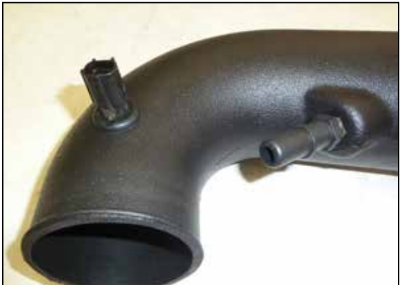
13. Install the provided CCV quick connect fitting into the K&N intake tube. Remove the IAT sensor from the factory intake tube, remove the O-ring from the sensor and then install it into the K&N intake tube using the provided grommet. NOTE: NPT fittings are easy to cross thread. Install the vent fitting "hand" tight, then turn it two complete turns with a wrench.