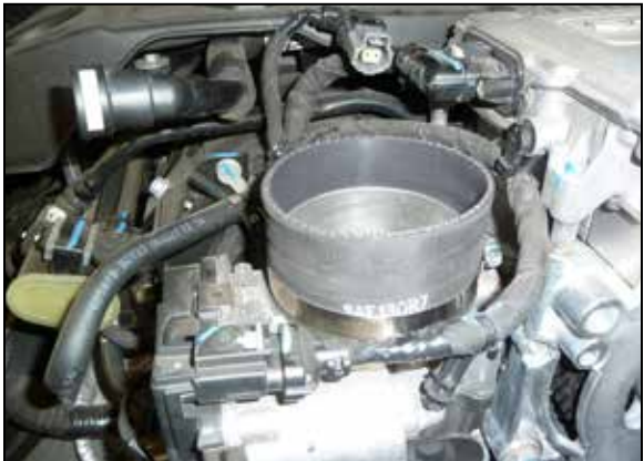
12. Install the provided straight coupler onto the throttle body and secure with the provided hose clamp.