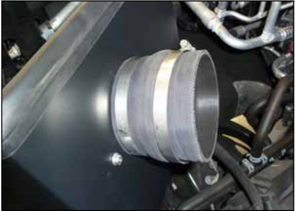
11. Install the provided hump hose onto the filter adapter and secure with the provided hose clamp.