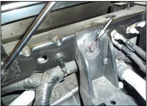
9. Remove the air filter housing mounting bracket bolt shown.