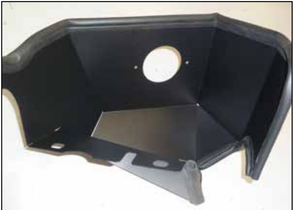
6. Install the edge trim onto the heat shield as shown. Some trimming of the edge trim will be necessary.