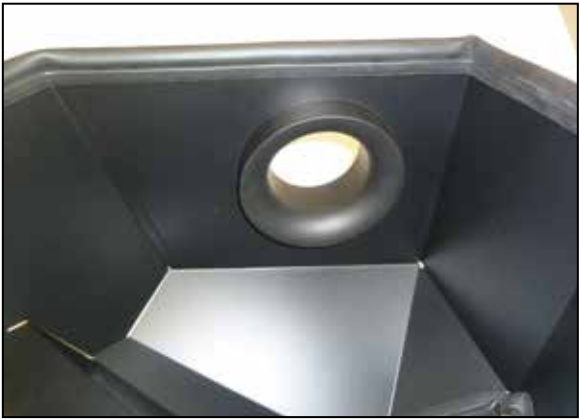
7. Install the filter adapter into the heat shield using the provided hardware.