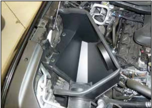
10. Install the K&N heat shield into the vehicle and secure with the factory bolt removed in the previous step. NOTE: The upper rear tap will go between the inner fender and the air filter housing mounting bracket.