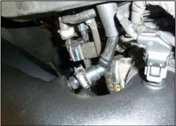
15. Connect the factory CCV hose to the quick connector installed into the K&N intake tube and reconnect the IAT sensor electrical connection.