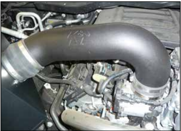
14. Install the K&N intake tube into the couplers, adjust for best fit and then secure with the provided hose clamps.