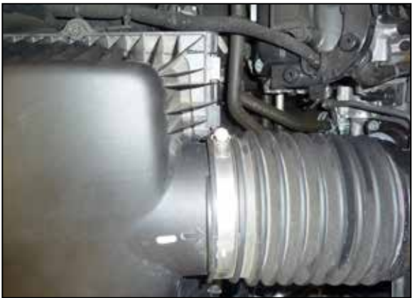
4. Loosen the hose clamp that secures the intake tube to the air filter housing. Remove the intake tube from the vehicle.