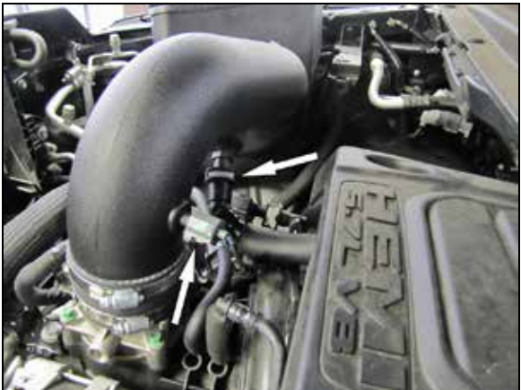
15. Reconnect the inlet air temperature electrical connection. Connect the factory crank case vent line to the quick disconnect fitting installed into the K&N® intake tube.