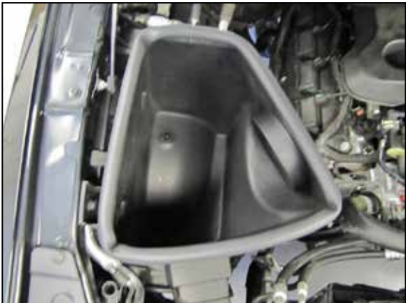
8. Install the K&N® air filter housing into the vehicle so the grommets fit onto the factory mounting posts.