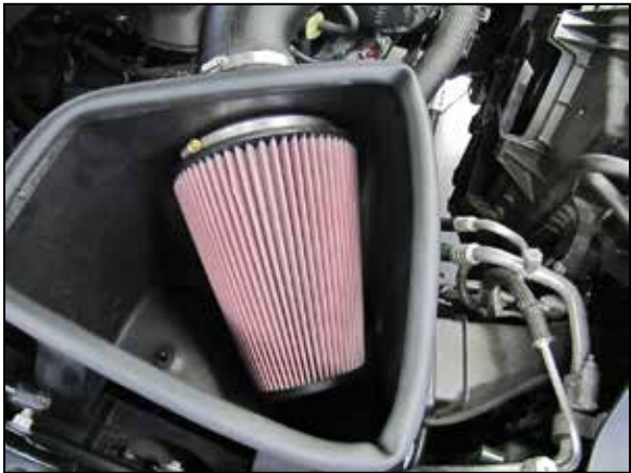
16. Install the K&N® air filter onto the filter adapter and secure with the provided hose clamp.