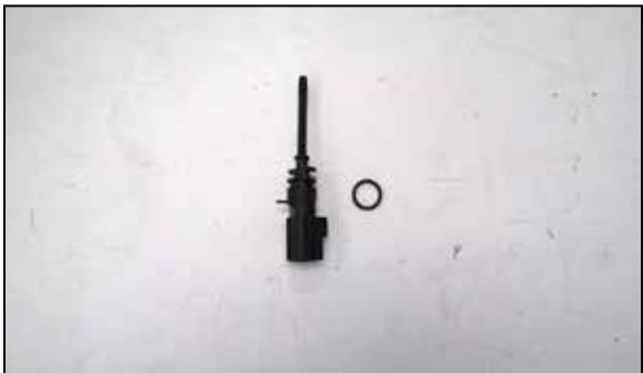
12. Remove the inlet air temperature sensor from the factory intake tube and then remove the O-ring from the sensor.