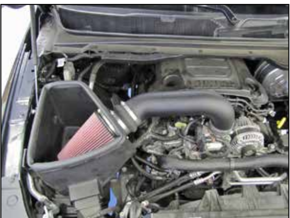
17. Reconnect the vehicle's negative battery cable. Double check to make sure everything is tight and properly positioned before starting the vehicle.