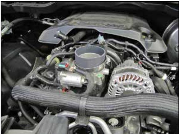
9. Install the provided coupler (08698) onto the throttle body and secure with the provided hose clamp.