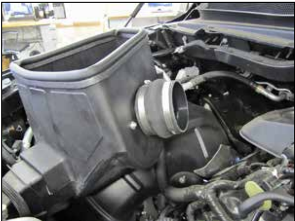
10. Install the provided hump coupler (08418) onto the filter adapter and secure with the provided hose clamp.