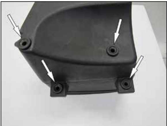
7. Remove the four mounting grommets from the factory air filter housing and install them into the K&N® housing as shown.