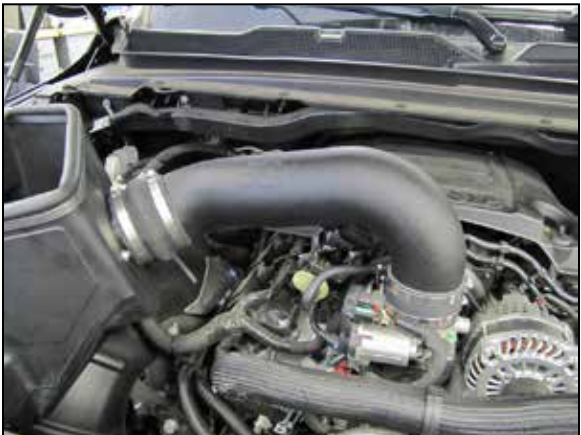
14. Install the K&N® intake tube into the hump coupler at the filter adapter and then into the coupler at the throttle body, adjust the tube for best fit and then secure with the provided hose clamps.