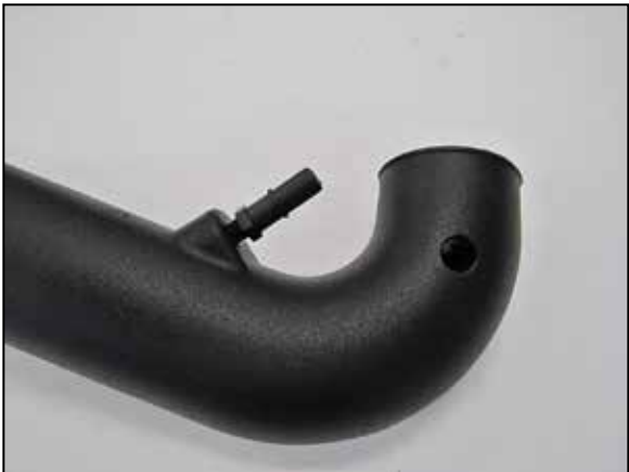
11. Install the provided NPT quick disconnect fitting into the K&N® intake tube as shown. NOTE: NPT fittings are easy to cross thread. Install the vent fitting “hand” tight, then turn it two complete turns with a wrench.