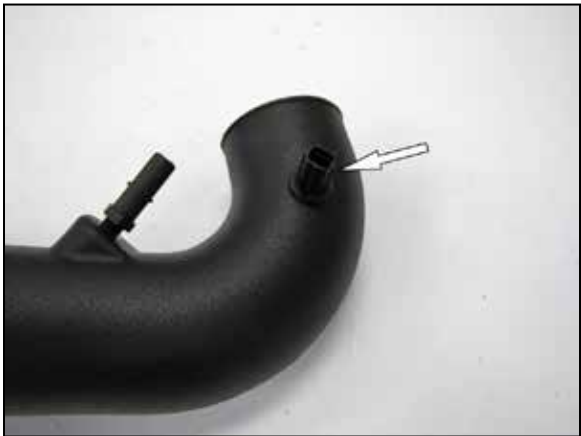
13. Install the sensor into the K&N® intake tube using the provided grommet.