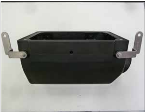
14. Install the lower mounting brackets onto the K&N air filter housing using the provided hardware.