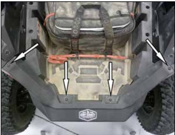
4. Remove the four bolts that secure the cargo box and then remove the cargo box.