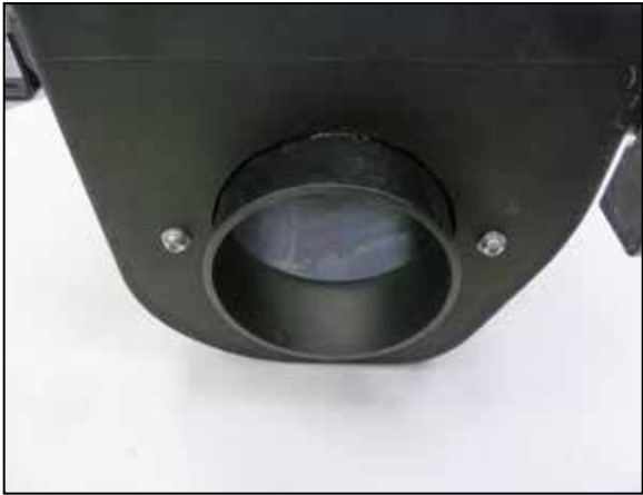
16. Install the radius filter adapter into the K&N filter housing using the provided hardware.