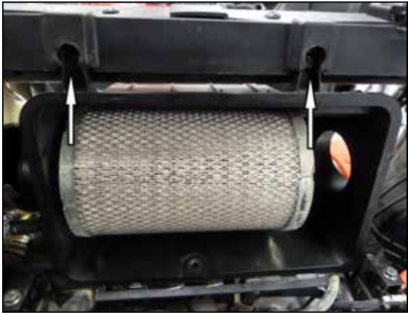
11. Remove the two bolts that secure the air filter housing to the chassis and then remove the housing from the vehicle. These bolts will be reused in a later step.