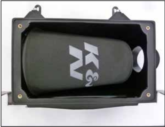
17. Install the prefilter onto the K&N air filter and then install the filter assembly onto the adapter and secure with the provided hose clamp.