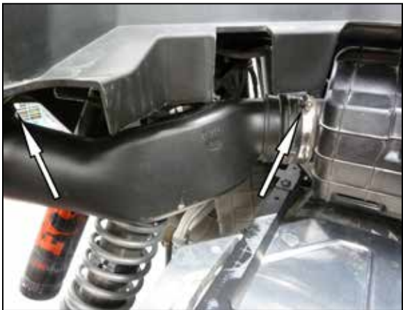
9. Loosen the clamps that secure the fresh air intake duct and then remove the duct.