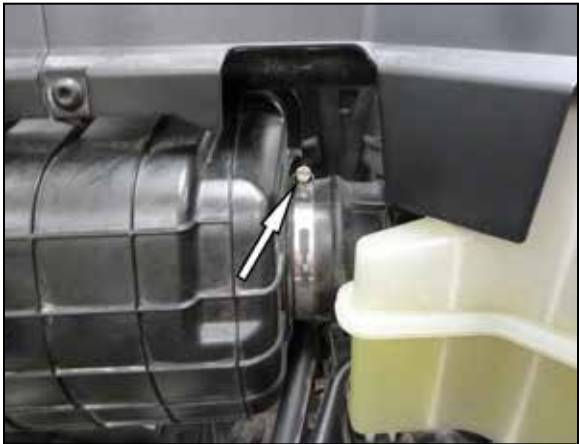
10. Loosen the clamp the secure the intake tube to the air filter housing and then remove then disconnect the intake tube from the housing.