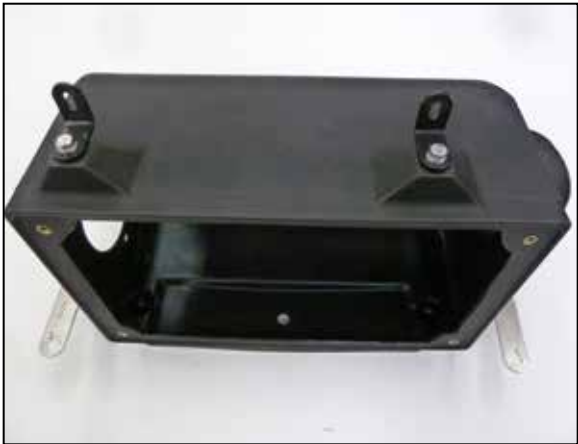
15. Install the two upper mounting brackets onto the K&N air filter housing using the provided hardware.