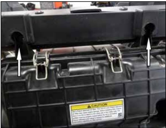
7. Using a 3/4" hole saw or similar device, drill into the trim panel to gain access to the air filter housing mounting bolts. NOTE: the bolts are just under the lip of the trim panel and easy to locate.