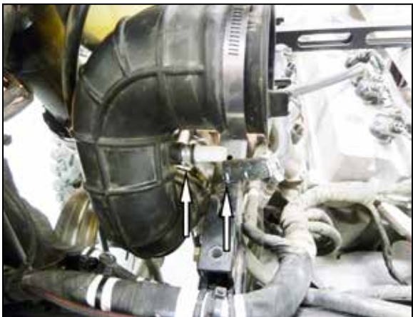
13. Disconnect the CCV hose from the factory intake tube. Loosen the clamp that secure the intake tube to the throttle body and then remove the tube.