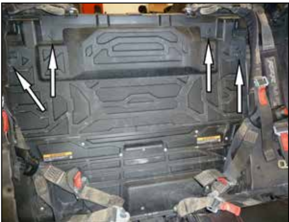
6. Release the four latches that secure the service panel and then remove the panel.