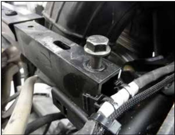
12. Remove the two large frame bolts that sit just to the left and right of the factory air filter housing. These bolts will be reused in a latter step.