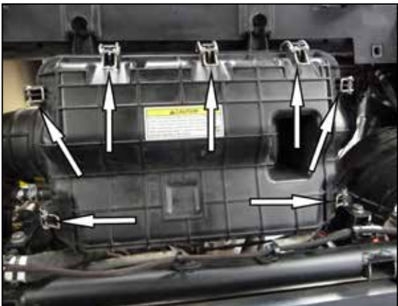
8. Release the seven over-center clamps that secure the air filter housing lid and then remove the lid.