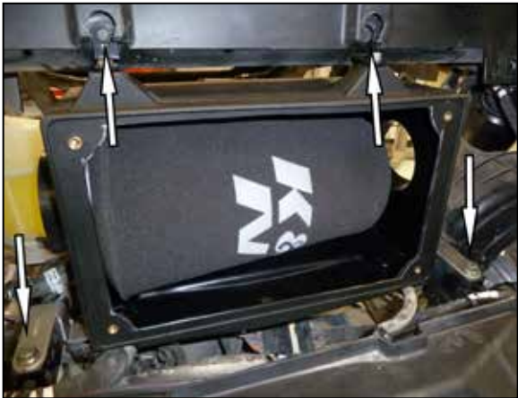
18. Install the filter housing assembly from the passenger compartment side and secure upper and lower mounting brackets with the factory hardware removed in earlier steps.