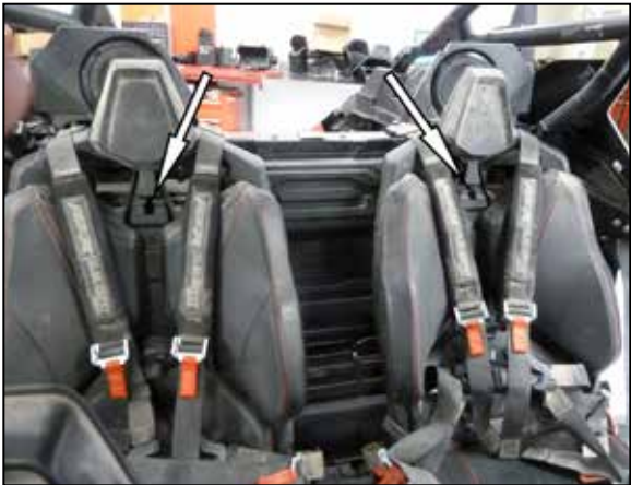
5. On four seat models, Release the latches that secure the rear seat backs and then remove the seat backs. On two seat models run the seats all the way forward.