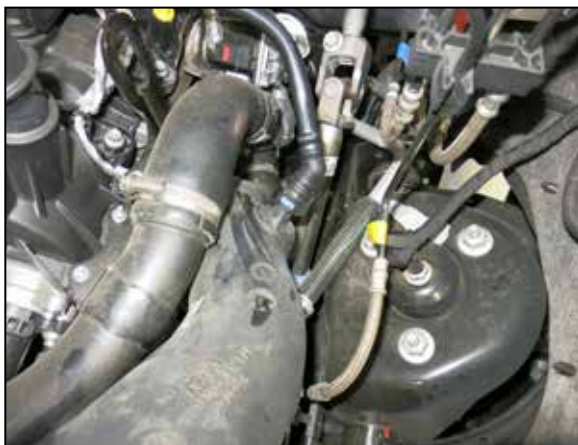
17. Reconnect the CCV hose connection.