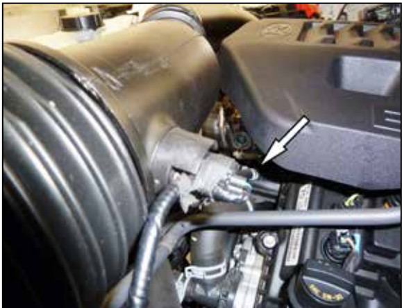
2. Disconnect the IAT sensor electrical connection.

1. Turn off the ignition and disconnect the negative battery cable. NOTE: Disconnecting the negative battery cable erases pre-programmed electronic memories. Write down all memory settings before disconnecting the negative battery cable. Some radios will require an anti-theft code to be entered after the battery is reconnected. The anti-theft code is typically supplied with your owner's manual. In the event your vehicles anti-theft code cannot be recovered, contact an authorized dealership to obtain your vehicles anti-theft code.