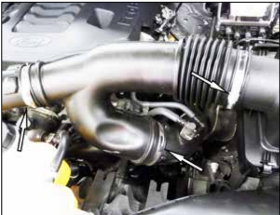
3. Loosen the three hose clamps that secure the factory intake tube and then remove the intake tube from the vehicle.